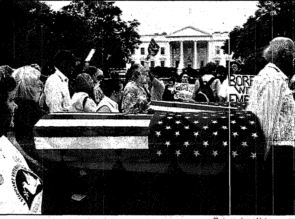
Demonstrators carrying coffins representing soldiers who died in Iraq during an anti-war

Cook Political Report. When the 1,000th American died in Iraq in September of last year, Bush stood less than two please see TOLL, Page 3