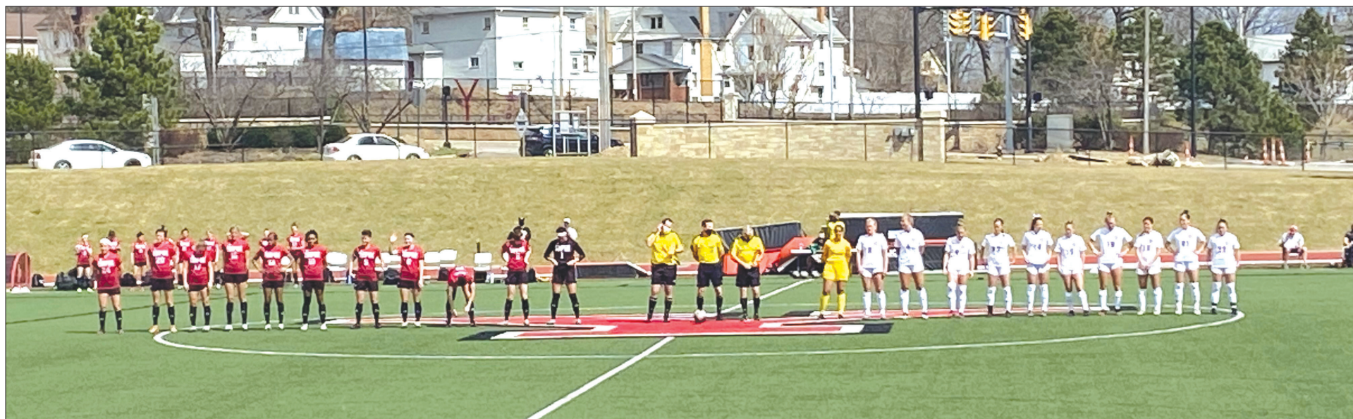
The women's soccer team faced off against IUPUI Wednesday.