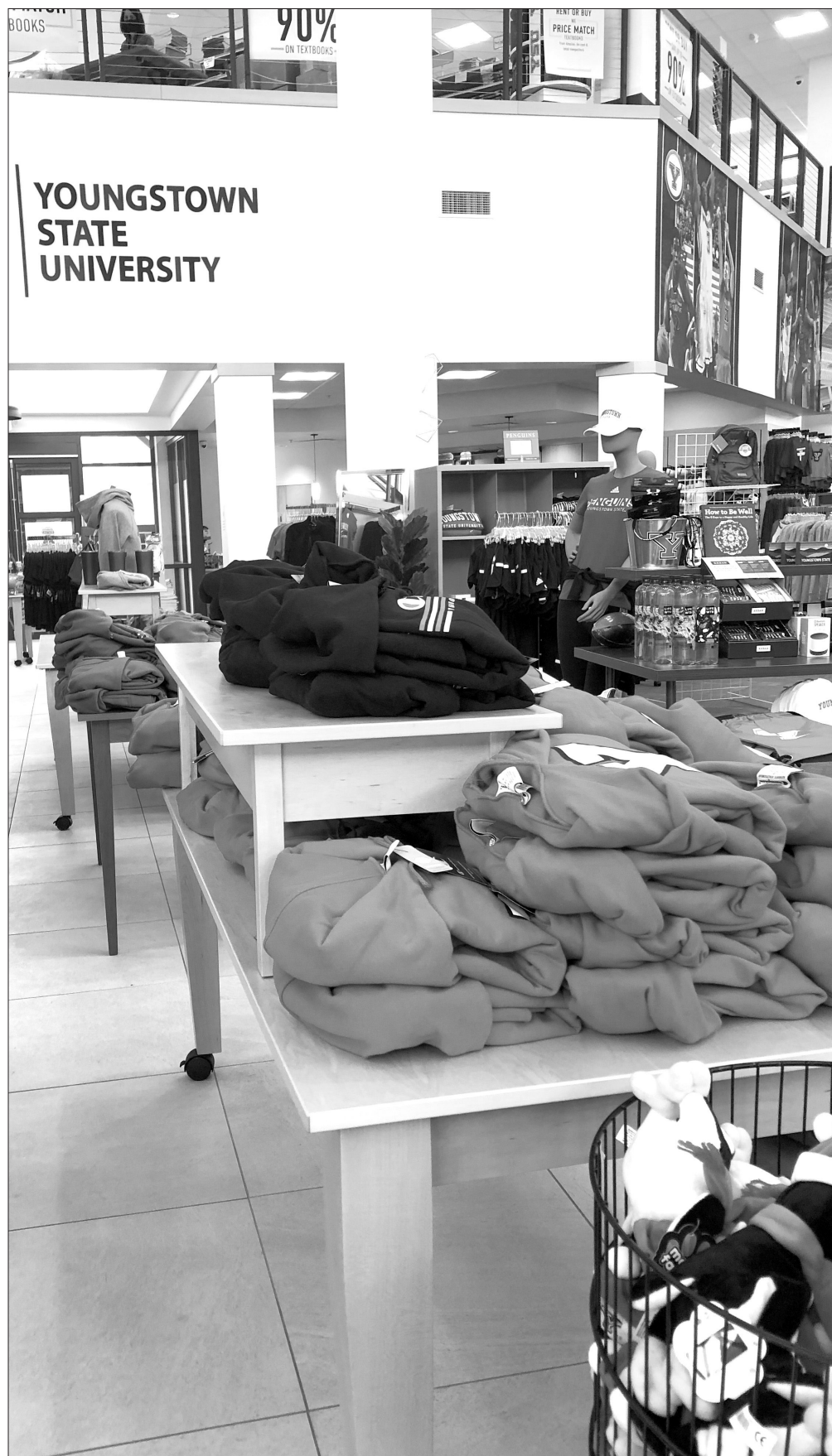
Students and fans of YSU can purchase spiritwear from the exclusive gear supplier on campus, Barnes & Noble.