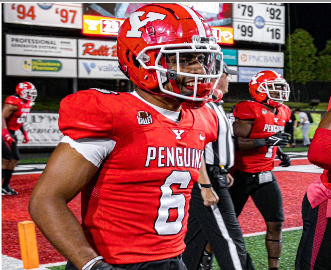
The football team scores a nail-biting OT win against Incarnate Word.