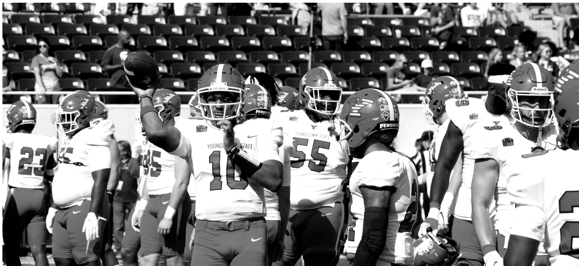
The football team falls against MSU on the road.