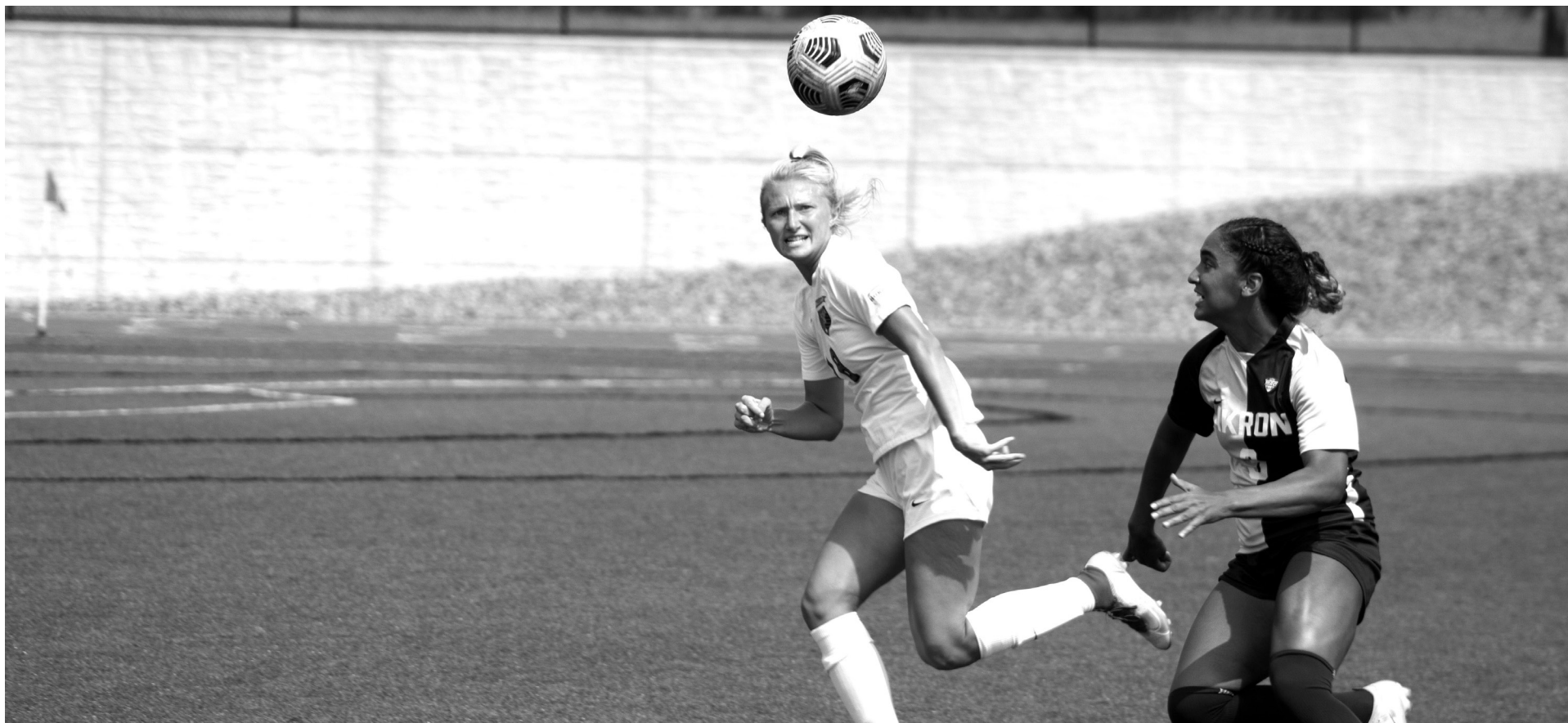
The women's soccer team faces off against the Akron Zips, concluding the team's non conference schedule.