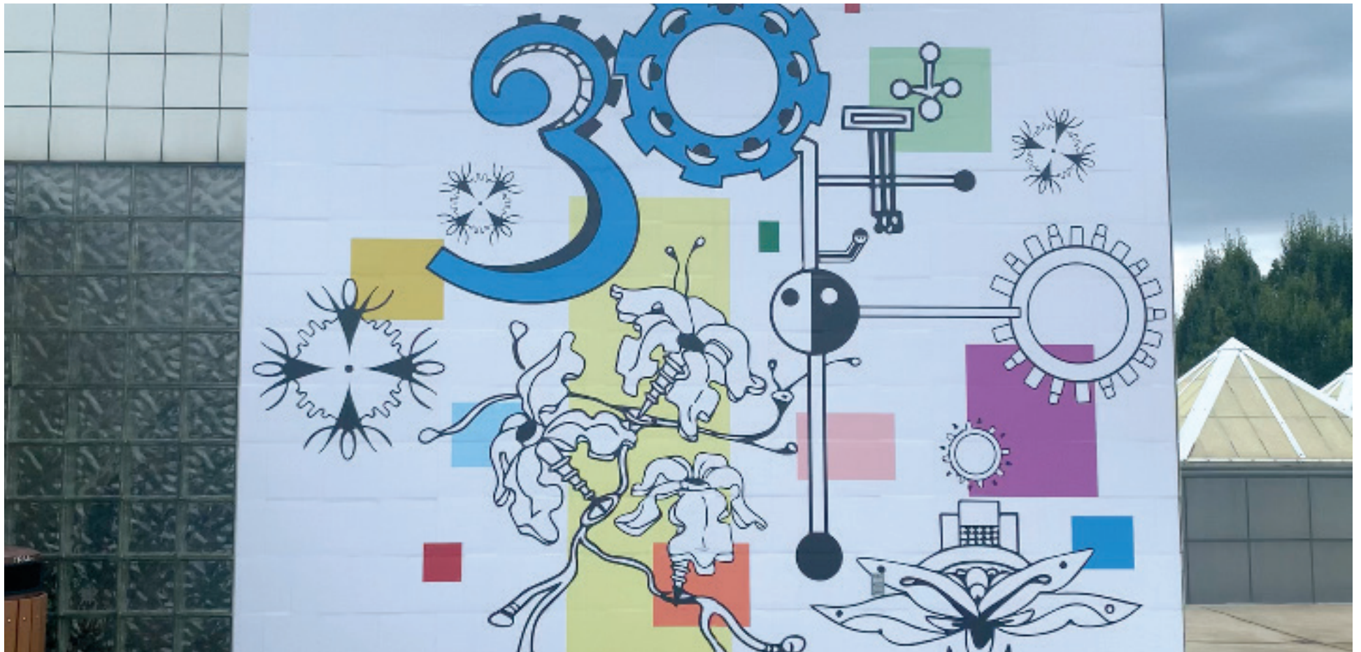
Upcoming anniversary events include an online fundraiser and guest speakers

Events will be on assigned days throughout the semester until the final day of BFA Exhibition, which spans Dec. 3 - 18. which spans Dec. 3 - 18.