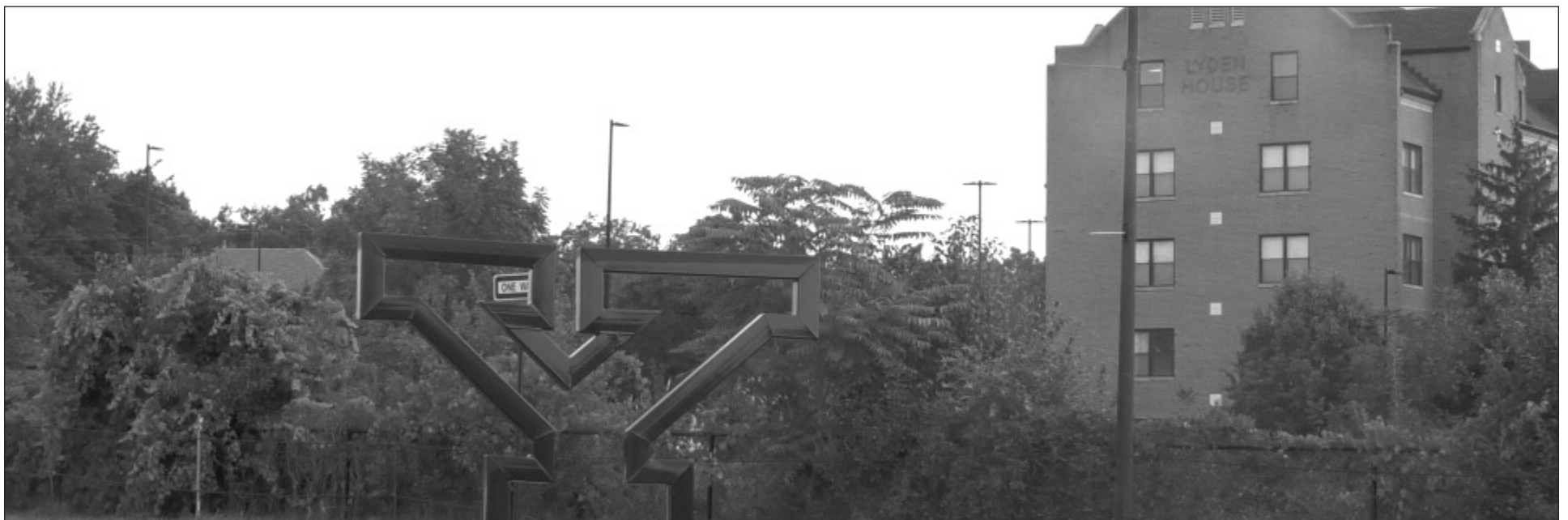
Lyden House is one of the five on-campus housing options.

For more information on housing options and services go to ysu.edu/housing-and-residence-life