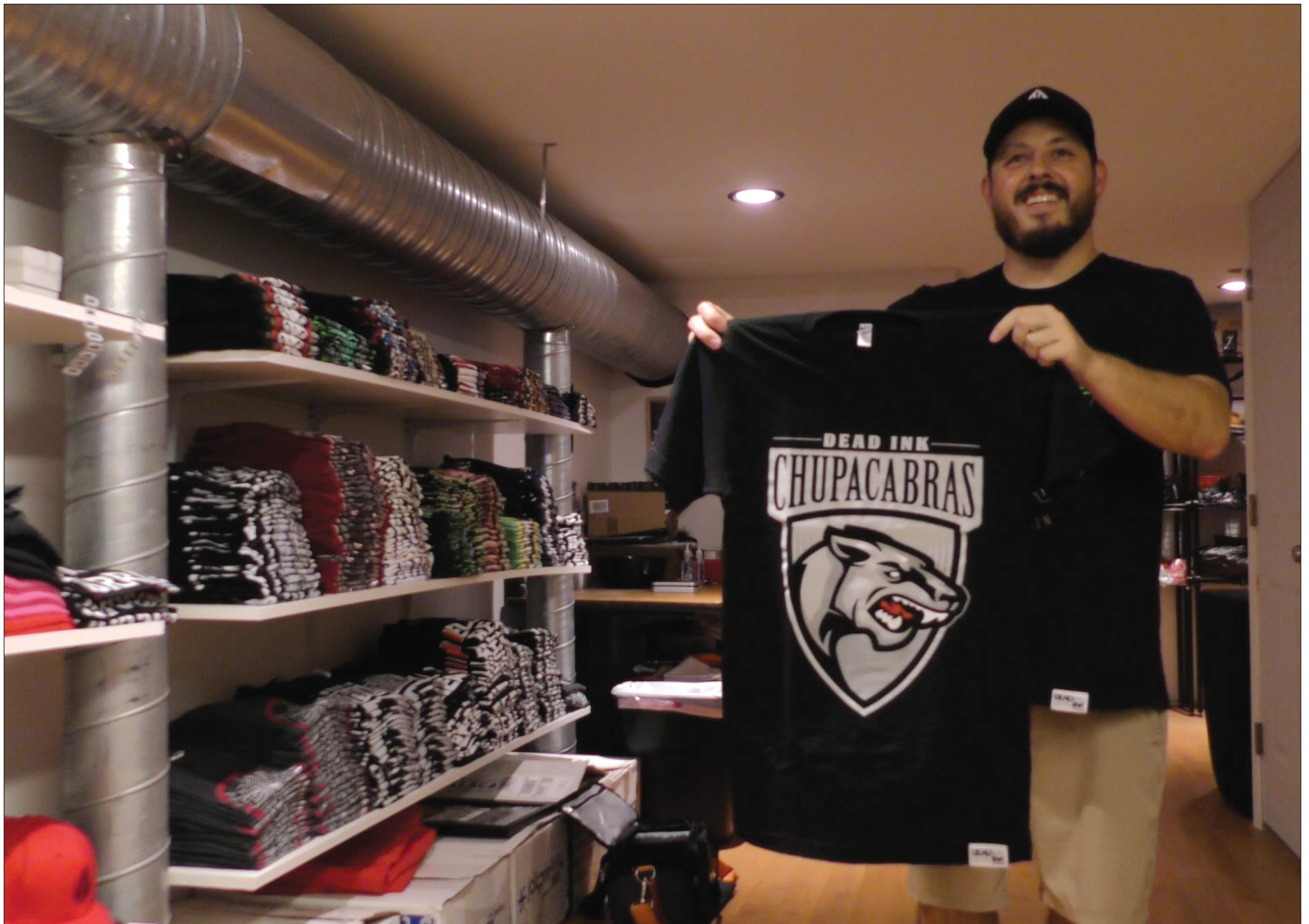
The chupacabra shirt is one of many Dead Ink Apparel offers for customers.

“Ghoul’s Night” tickets cost $10, and attendees must be ages 21 and up. For more information, check out Dead Ink Apparel on Instagram @deadinkapparel or its website deadinkapparel.storenvy.com