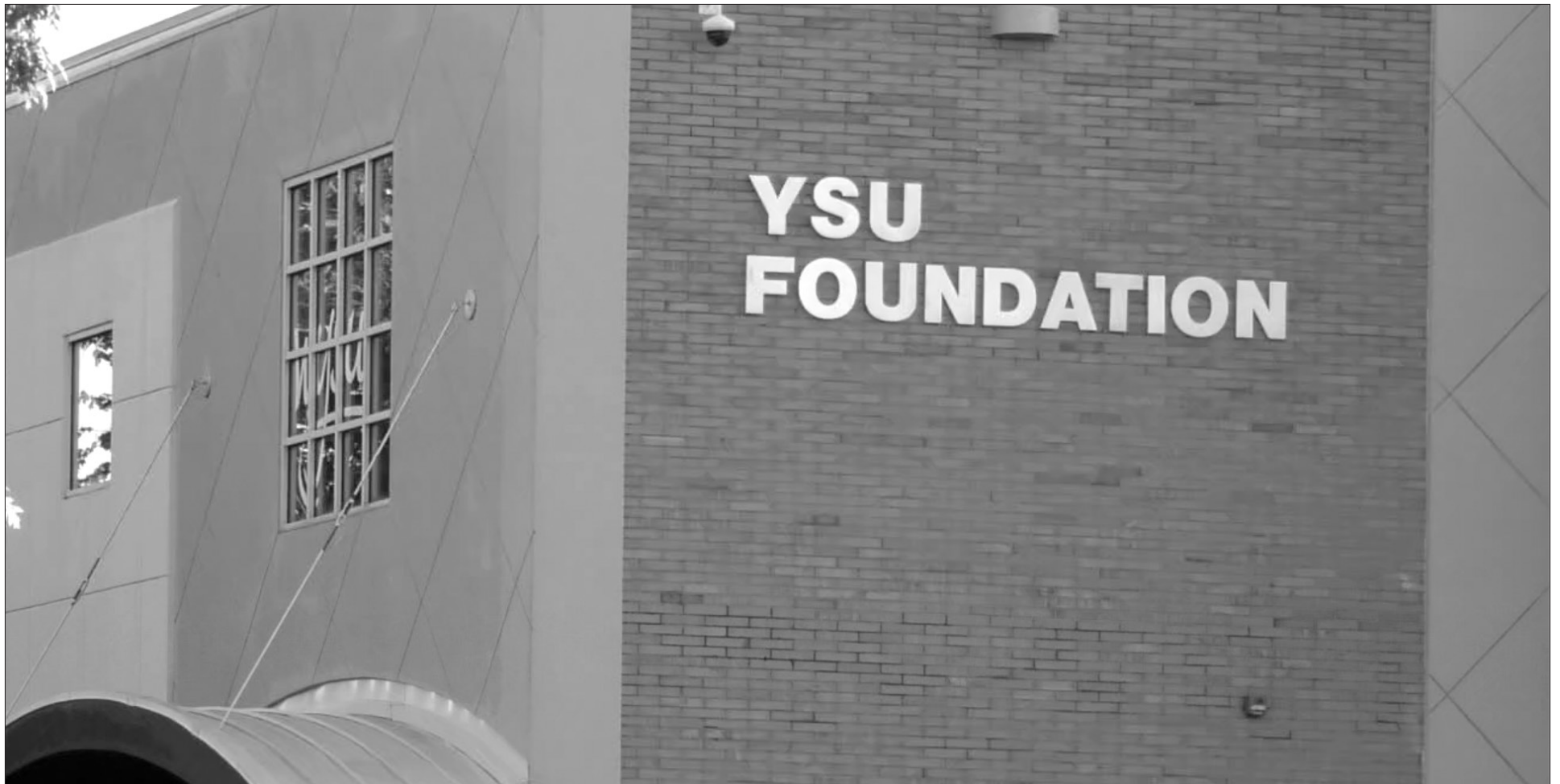
The YSU Foundation helped students with financial funding at the beginning of the pandemic.

Anyone with questions or concerns about federal and state aid eligibility can contact the Office of Financial Aid and Scholarships at ysufinaid@ysu.edu