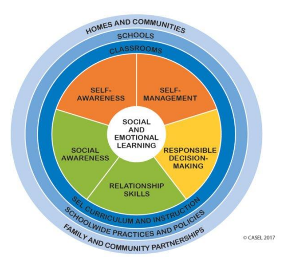
Figure 3 CASEL's Framework

For the first few years, the district focused on the development of these skills with staff and students in the elementary grades. When looking at how to implement the skills into the high school, consultants and administrators began to look at creating courses. During the 2013-2014 school year, all students in grades 9-12 at Warren G. Harding High School were enrolled in an advisory course, and almost every content area and elective teacher in the building had a roster of students. The course met daily, and the goal of the course was to implement academic support or intervention and SEL skills. Placements were determined by student data. The building administration discovered that there was not adequate content to support the need for the course at all four grade levels, and there had not been adequate staff training to ensure that all students received the desired skills.