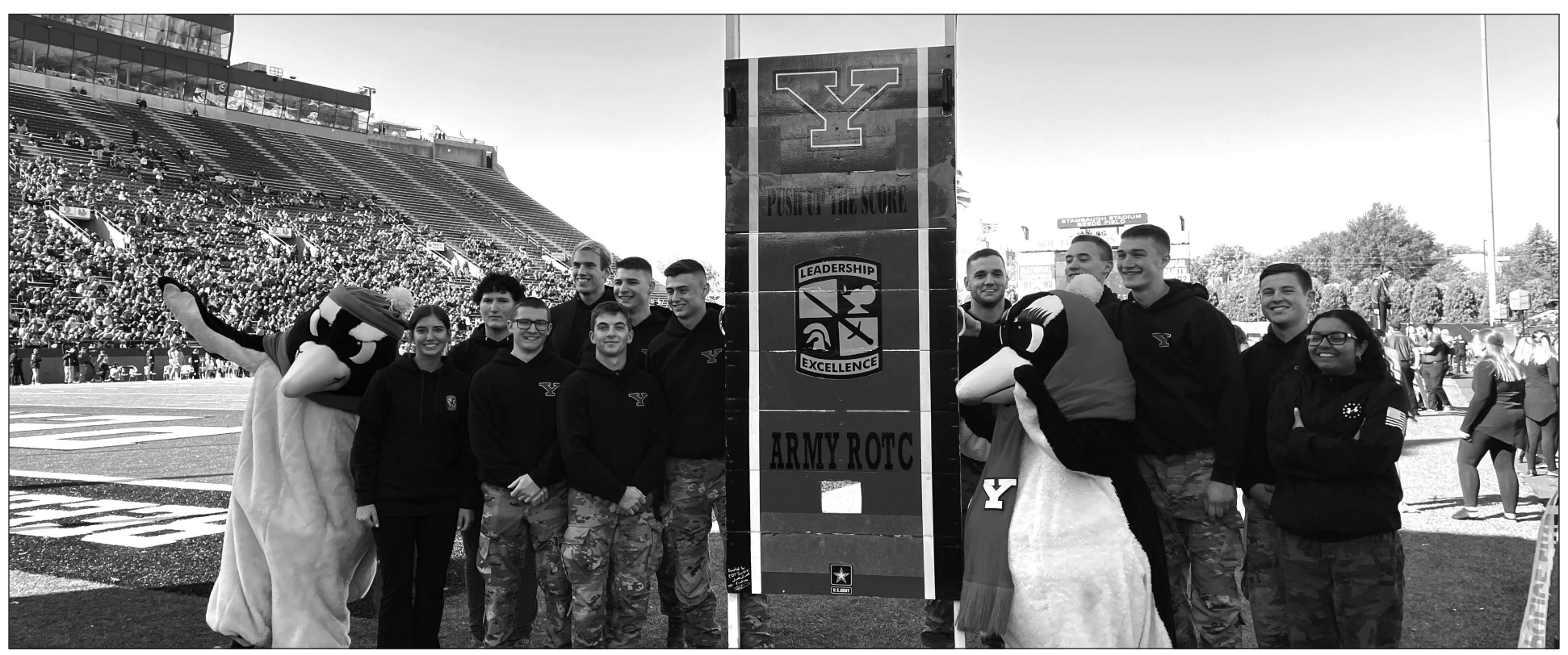
During football games, YSU ROTC leads school spirit activities.