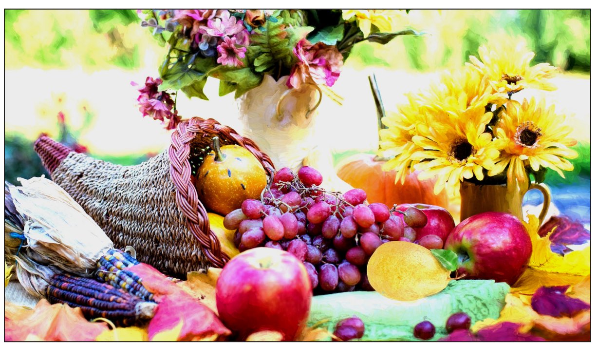
Cornucopias are widely used to symbolize Thanksgiving.