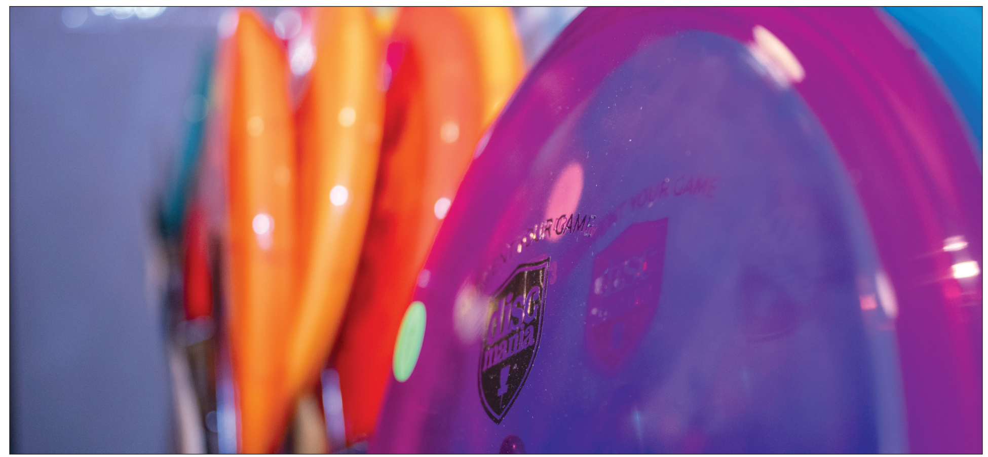
Youngstown Disc Golf Club's Winter Putting League offers a way to stay active during the cold season.