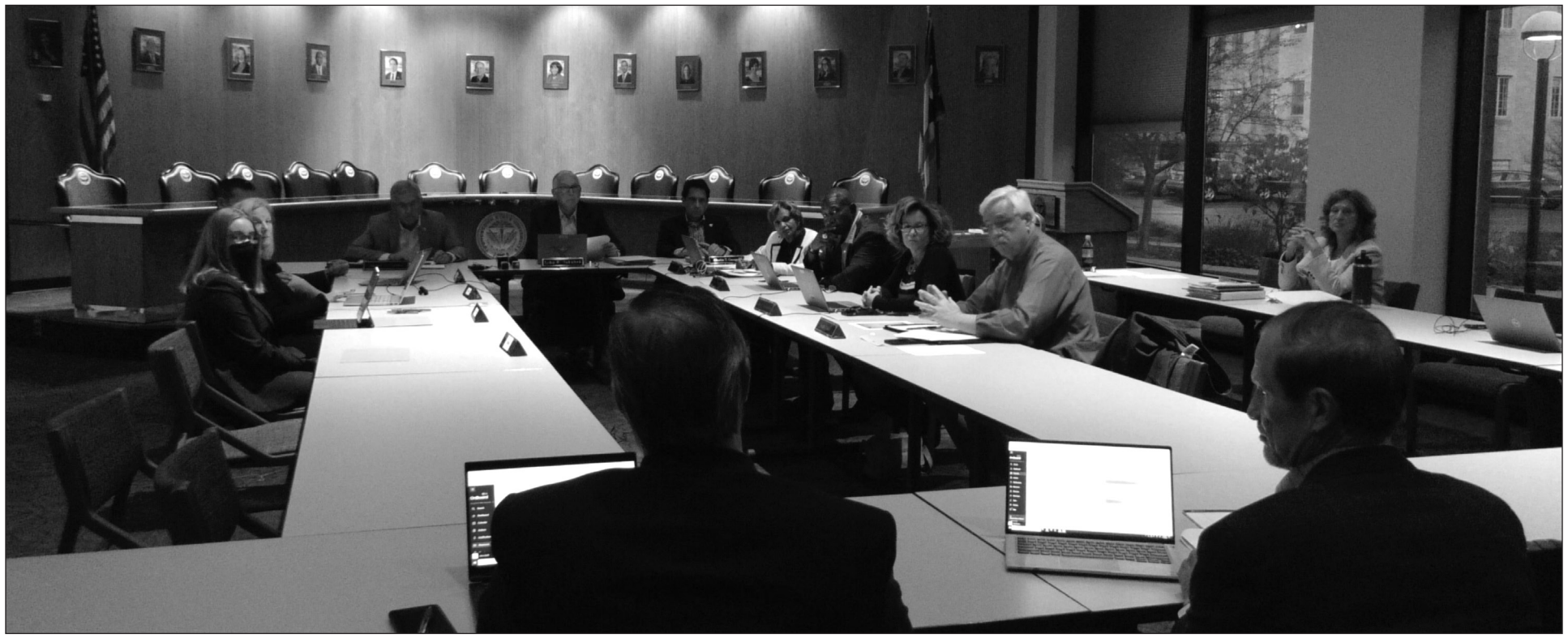
Continuing cuts? Board of trustees calls special meeting before December decisions.

The next board of trustees meeting is scheduled for Dec. 9 in Tod Hall at 10 a.m. following the Dec. 8 individual committee meetings.