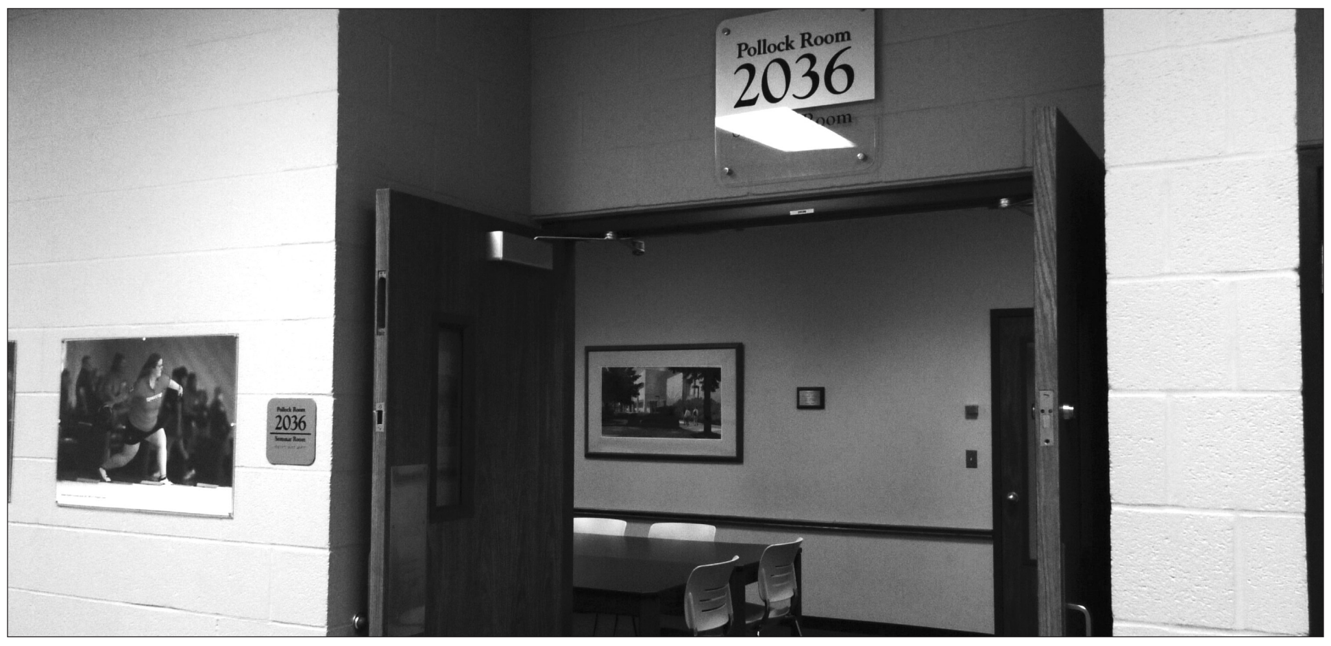
YSU for Recovery holds meetings in the Pollock Room of Kilcawley Center on Tuesdays.