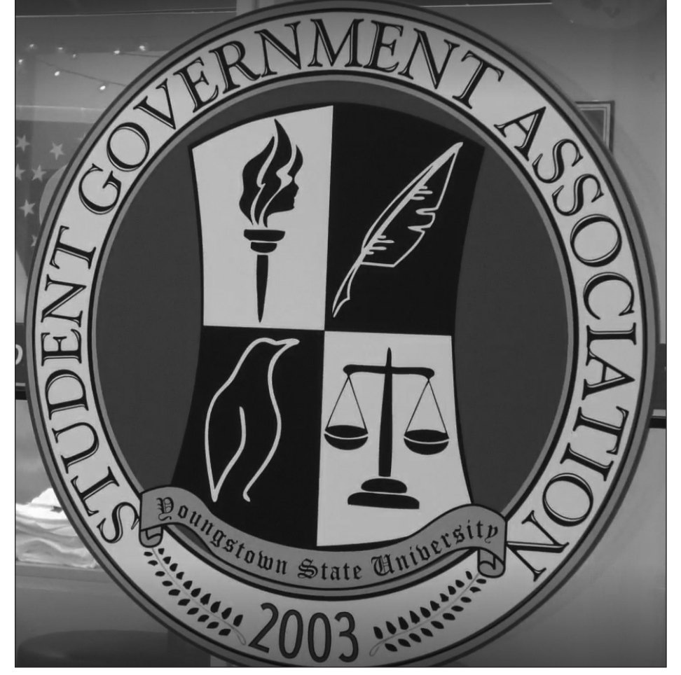
SGA hosted Swipe Out Hunger Week.

For more information about Swipe Out Hunger, vis-Following the Board of Professionals Panel, the Hunitist website. For more information about the Student Government Association, visit its website.