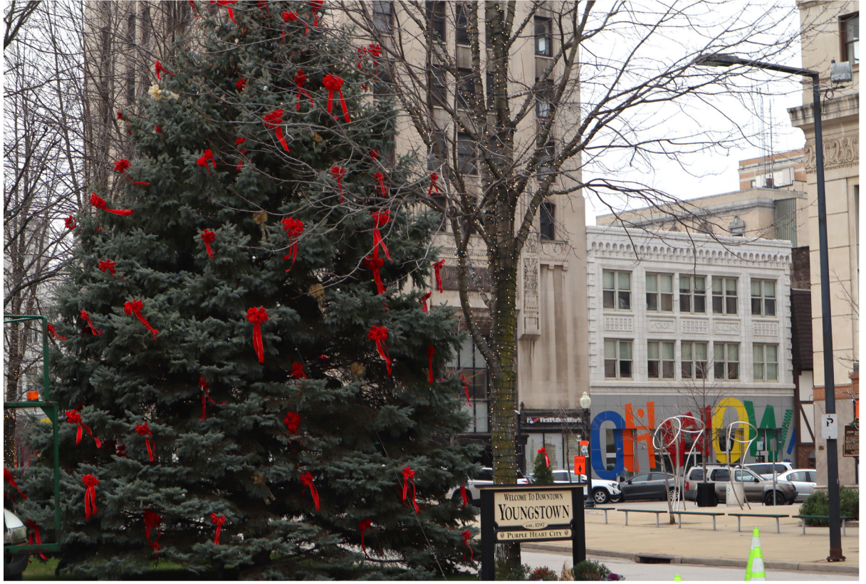
The Holiday Parade will begin at 6 p.m. at the Covelli Centre.