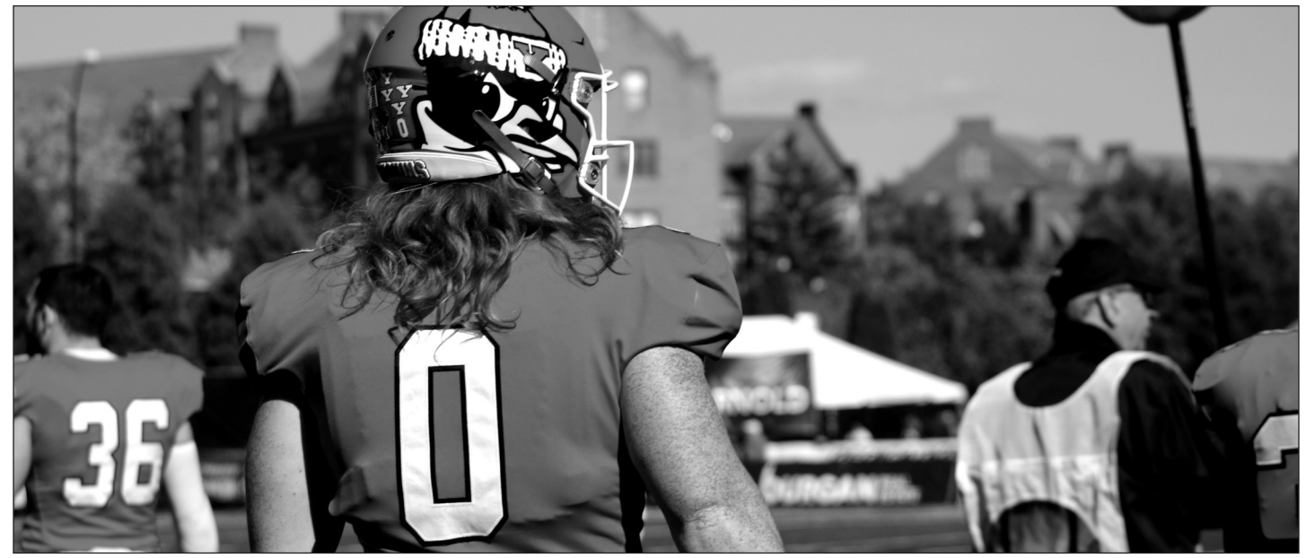
Penguins fall short of playoffs.

Despite finishing the season 7-4, the football team's campaign came to an end after not being voted into the FCS playoffs. Its seven wins this season are the most for Youngstown State since the 2016 FCS runner-up season.