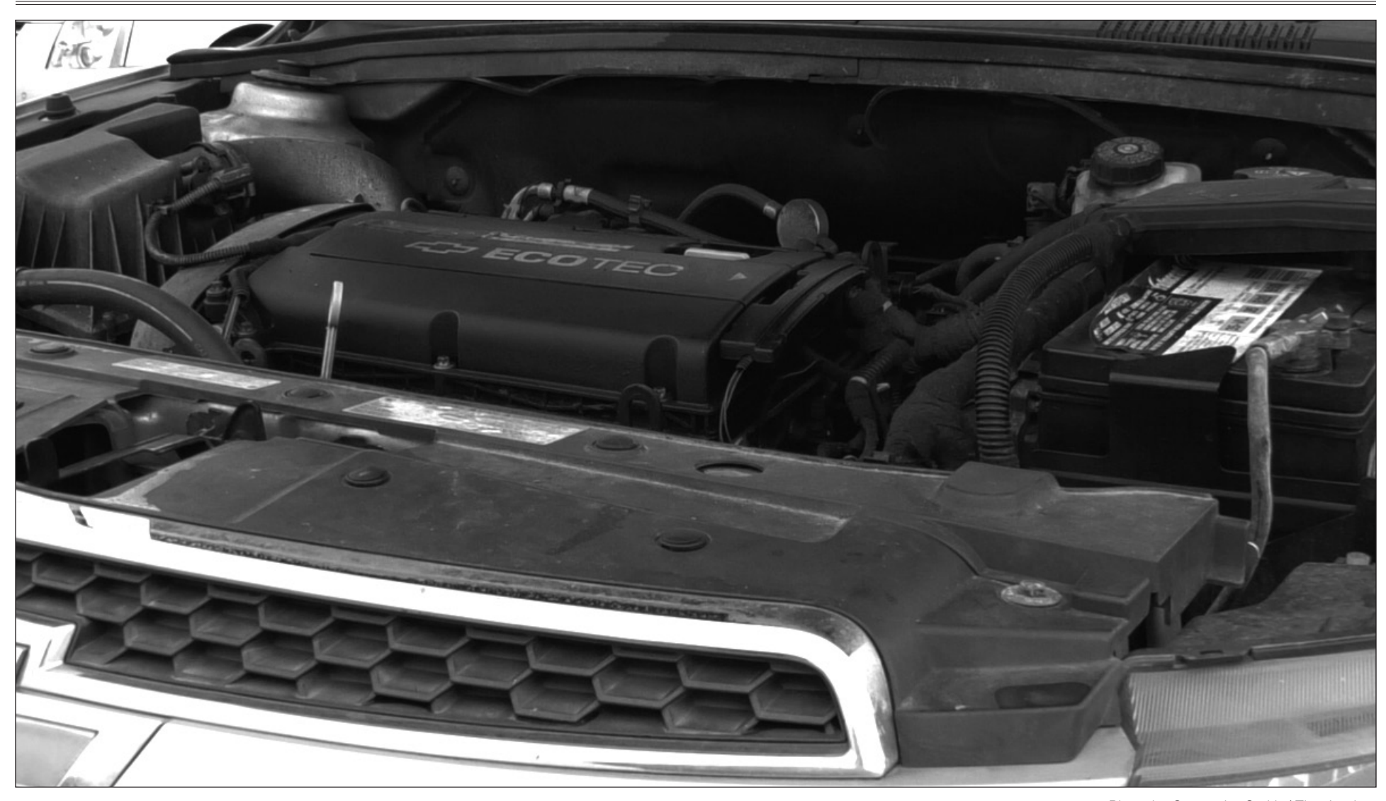
Preparing your vehicle for winter is important.