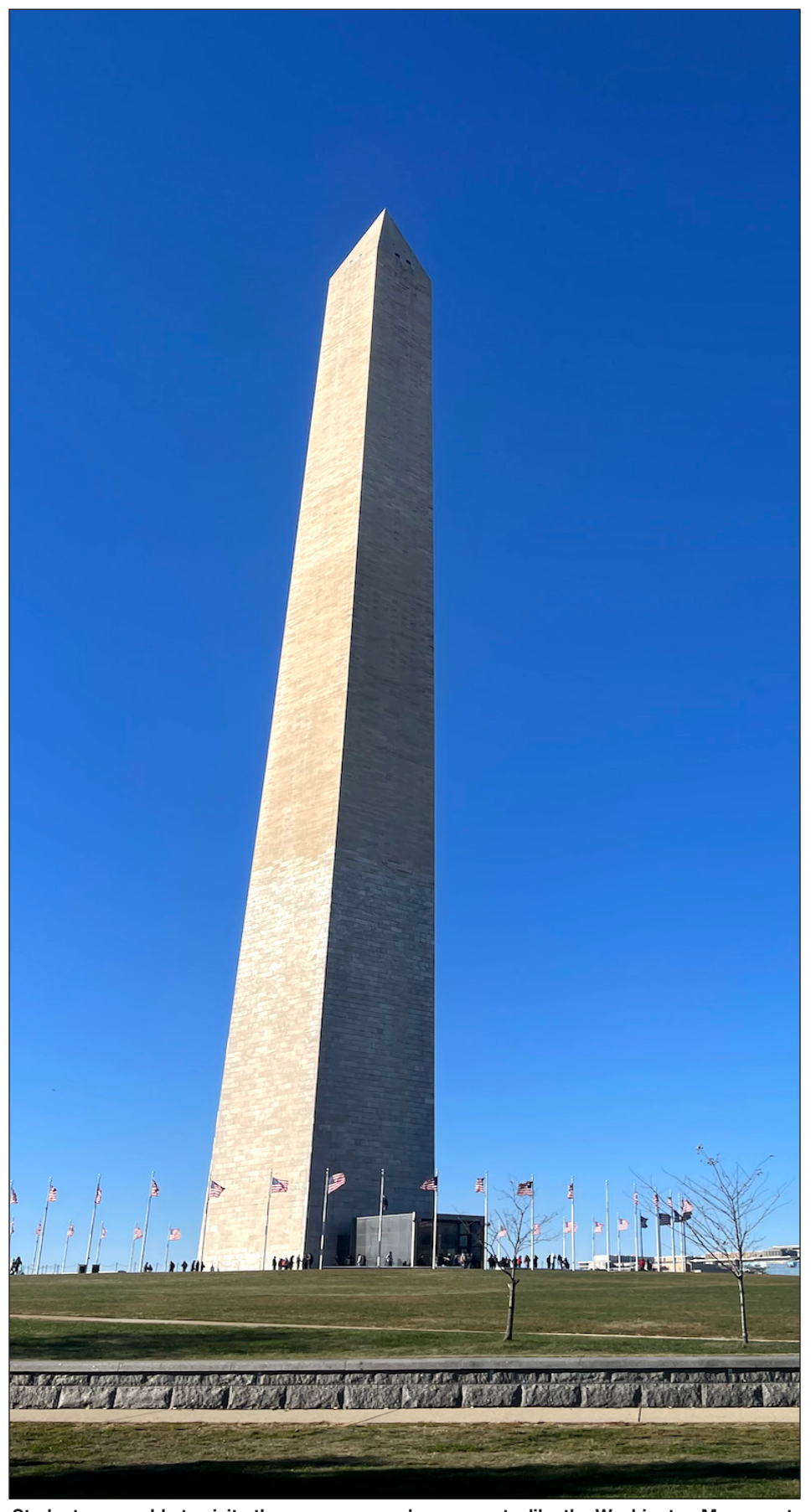
Students were able to visit other museums and monuments, like the Washington Monument.