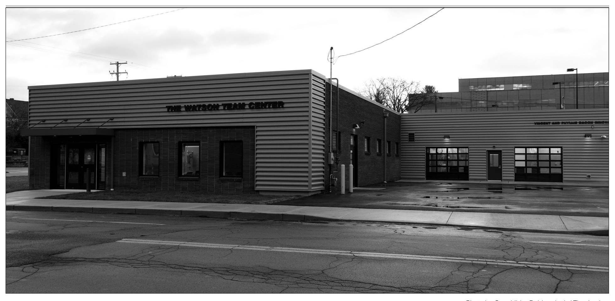
The Watson Team Center has been constructed in place of an old flower wholesaler.