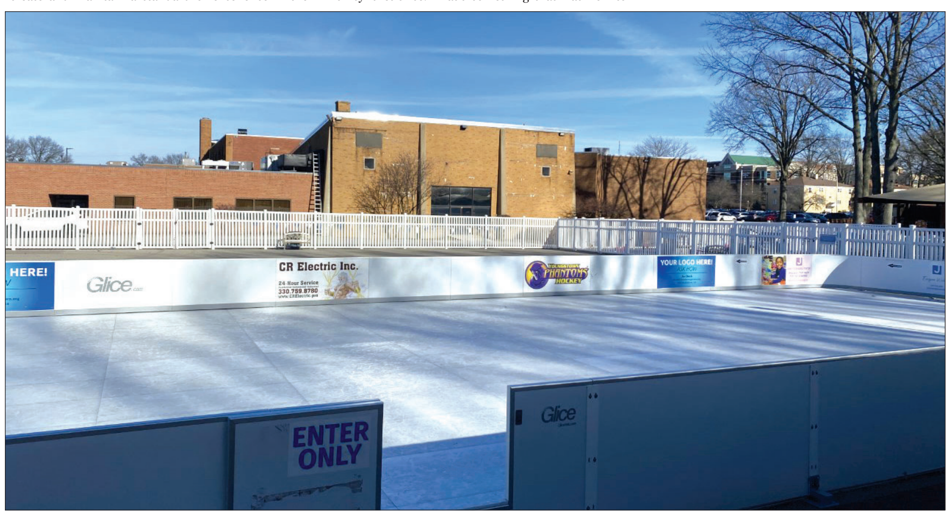
JCC's ice rink is open for business this winter.

The ice rink is open Thursday and Friday from 4 to 8 p.m. as well as Saturday and Sunday from 12 to 6 p.m. For more information about JCC winter events and its ice rink, visit its website.