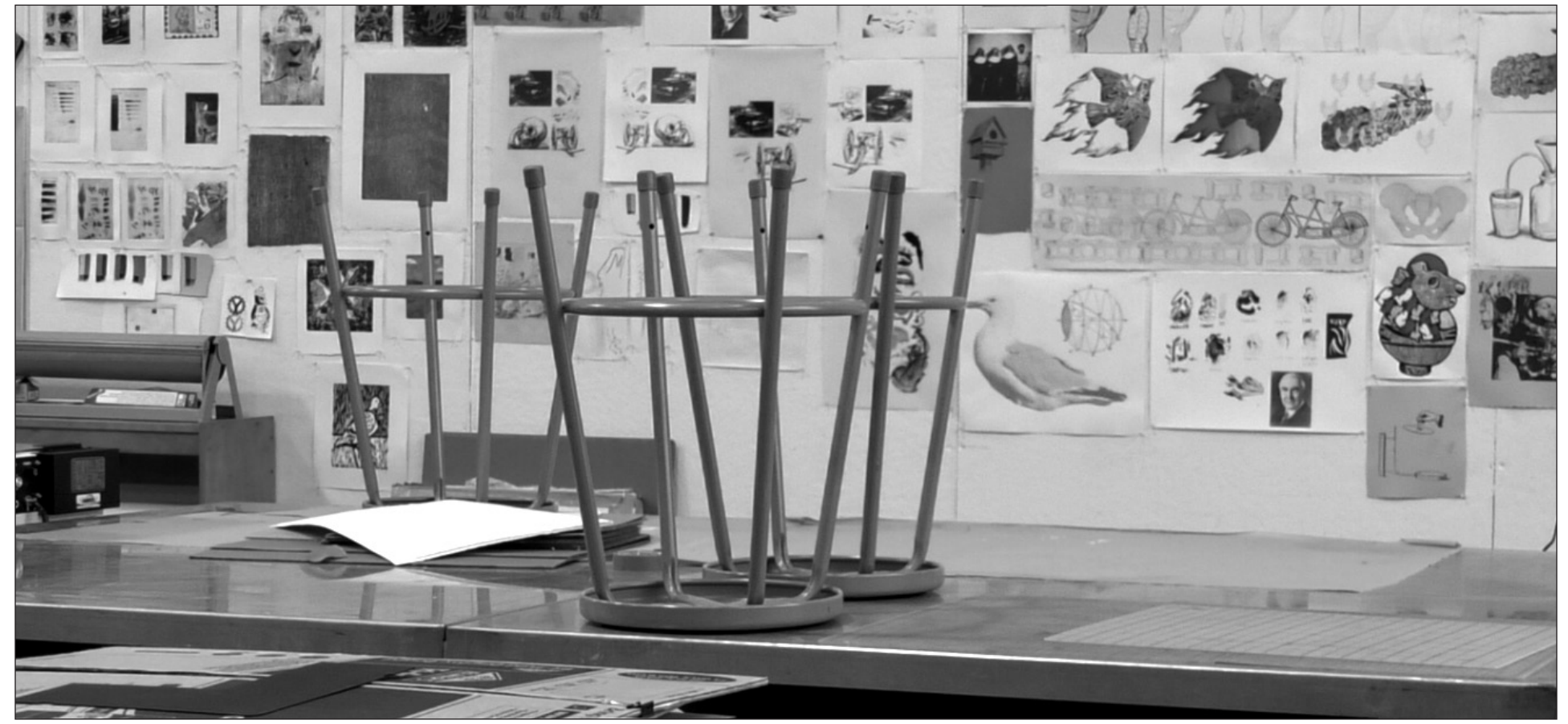
Some art students are having trouble finsihing their degrees because of cuts to the program.