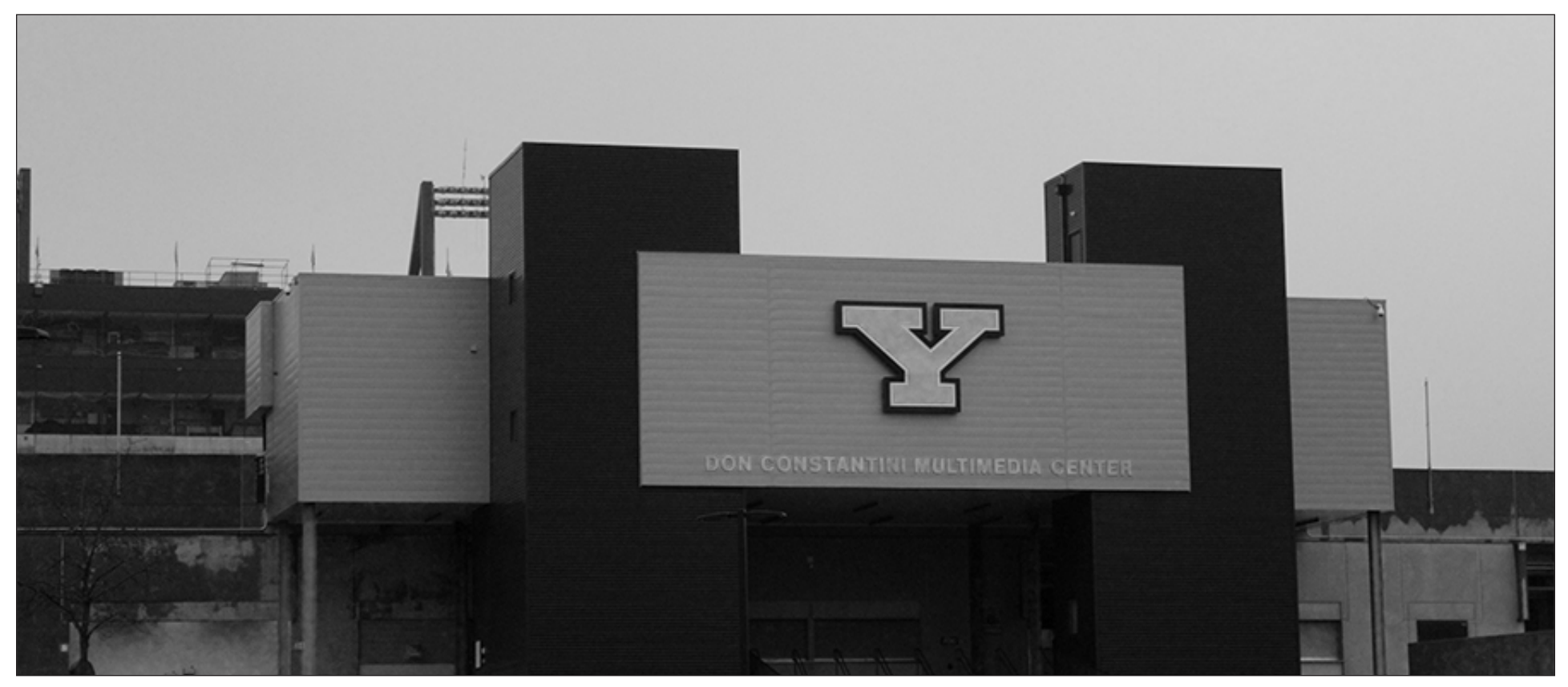
Stambaugh Stadium is one of the main athletic buildings on campus, housing the Athletic Department.