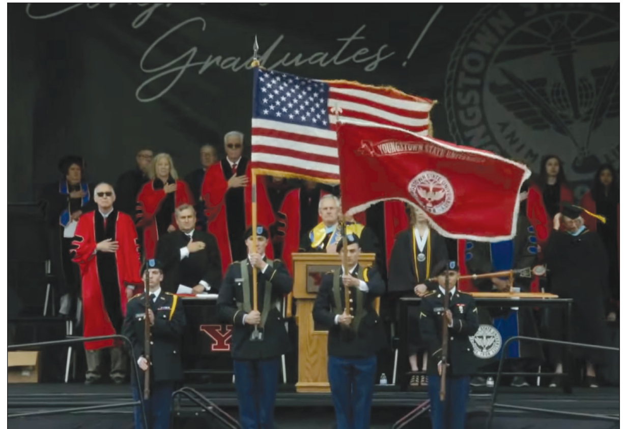
2022 spring commencement.