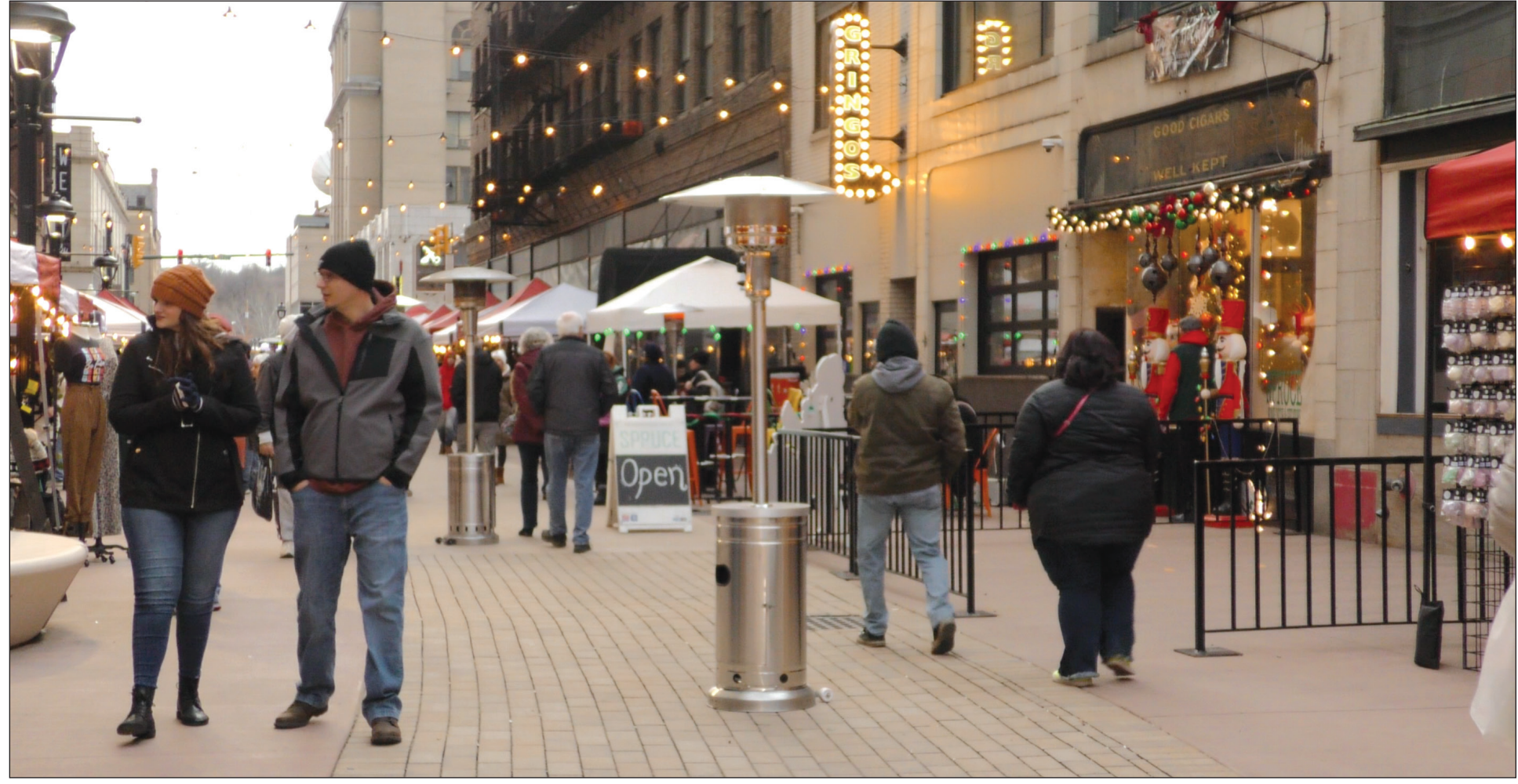
The Youngstown community gets into the joyful winter celebrations at the Flea on Phelps.