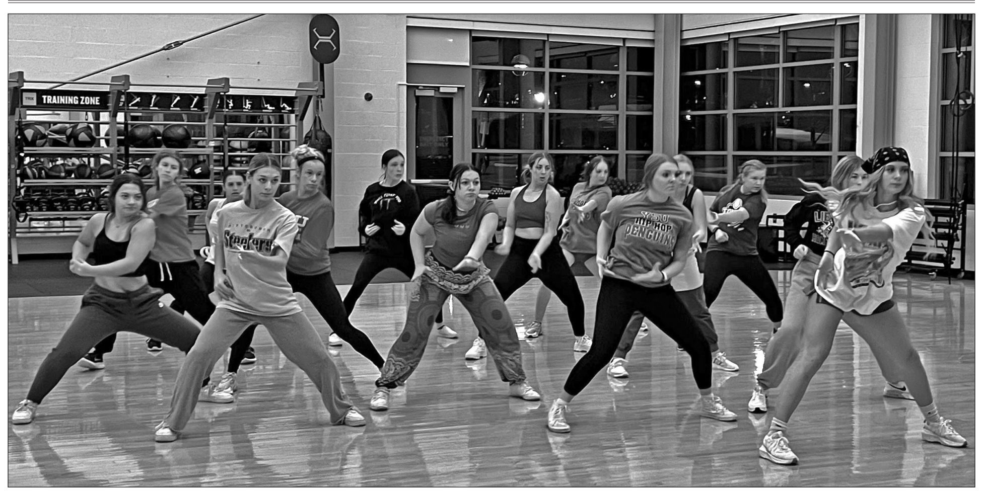
The Hip Hop Club rehearses choreography they created.