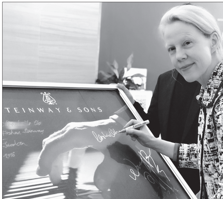
Certificate for the Steinway Top Teacher Award.