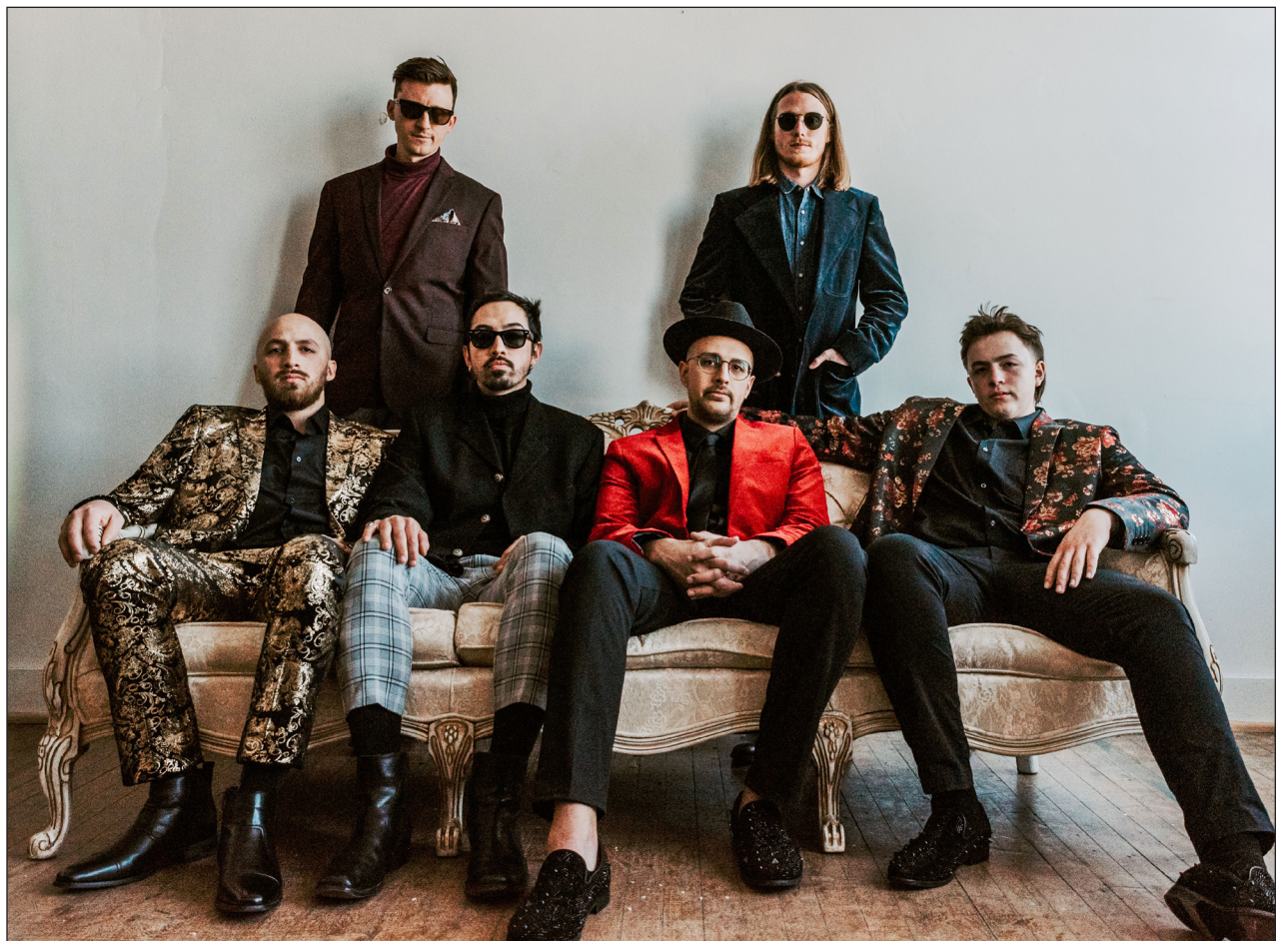
The Labra Brothers will perform at the Music & Art on Oak Glen 2023.

The Labra Brothers EP, with three new songs, is now streaming on Spotify and Apple Music.