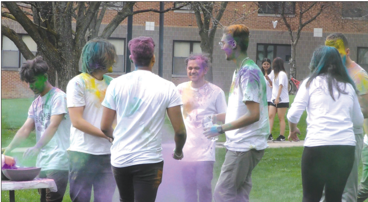
Holi is also known as the Festival of Colors.