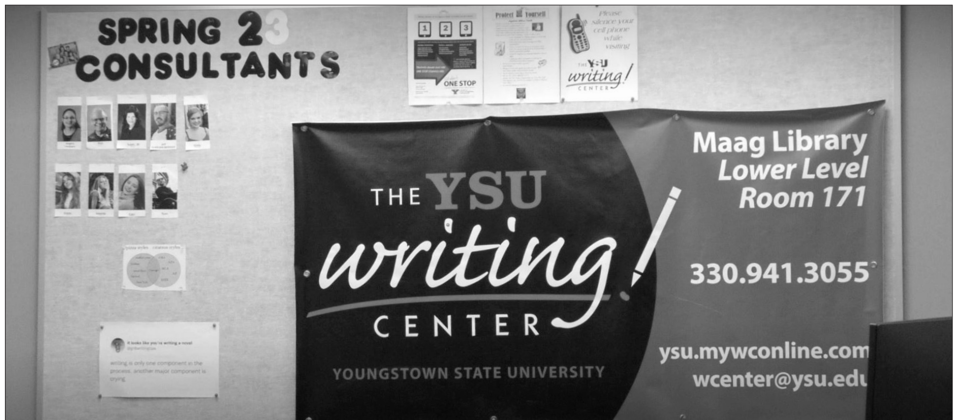
The Writing Center's main location is on the bottom floor of the William F. Maag Jr. Library.

For more information about the Writing Center, visit its webpage.