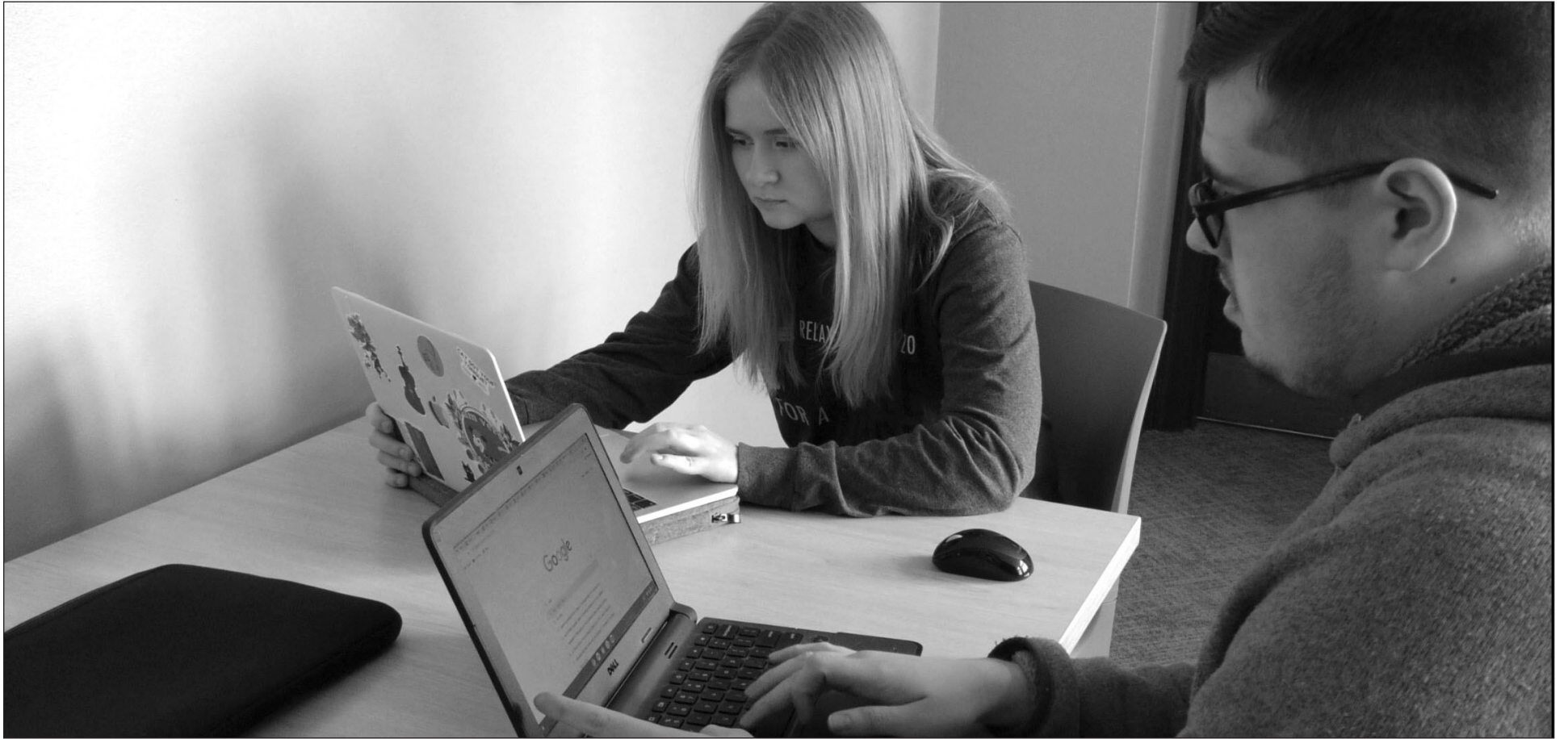
Guins Against Cancer plans Relay for Life.