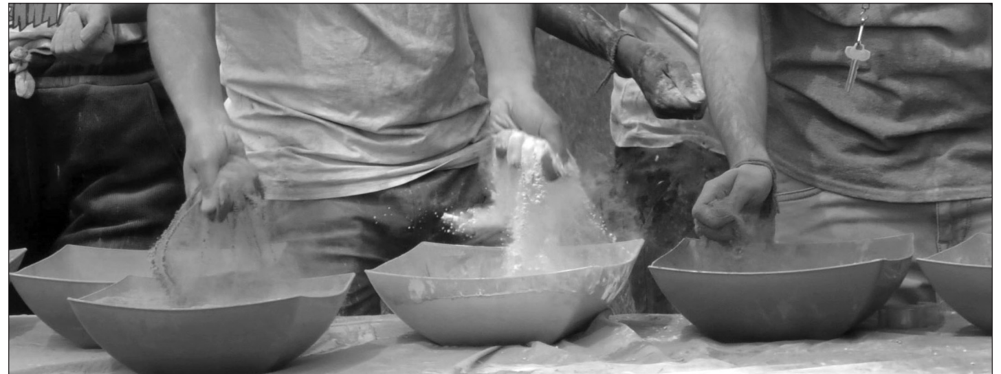
Students throw powdered colors at each other for the Festival of Colors.