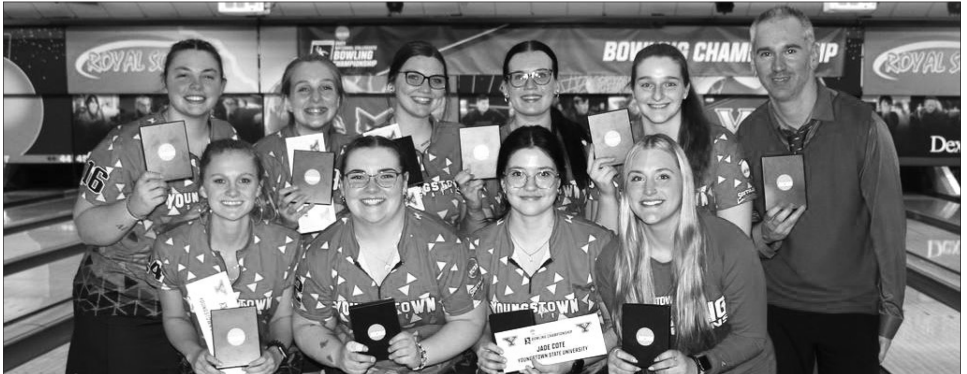
The bowling team finishes runner-up.

To keep up with the bowling team and its offseason, visit ysusports.com