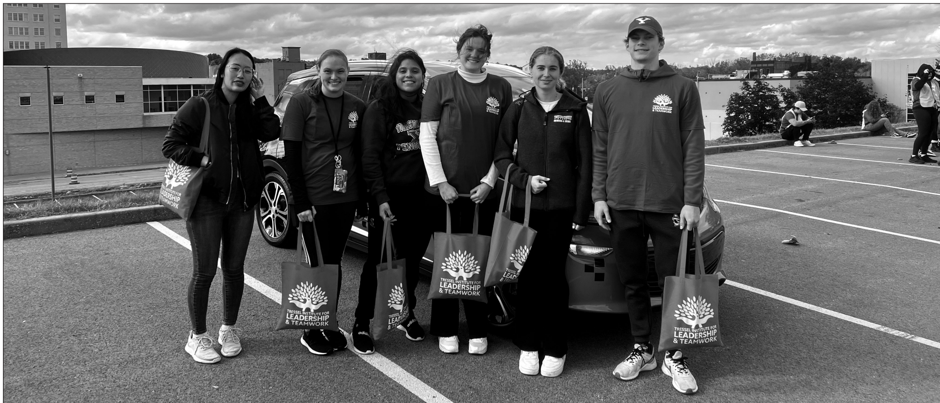
The Tressel Institute appeared at the 2022 Homecoming Parade.