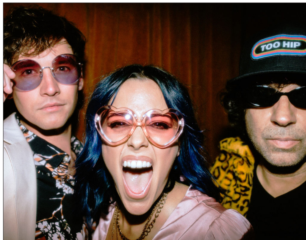
The Vindy's will be at The Record Connection on April 22.