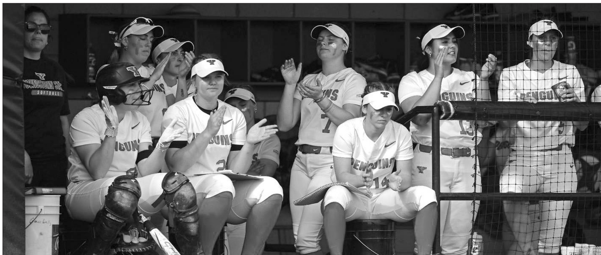
YSU Softball cheers on teammates.

Youngstown State is back in action against University of Wisconsin-Green Bay over a three-game span, April 21 to 22.