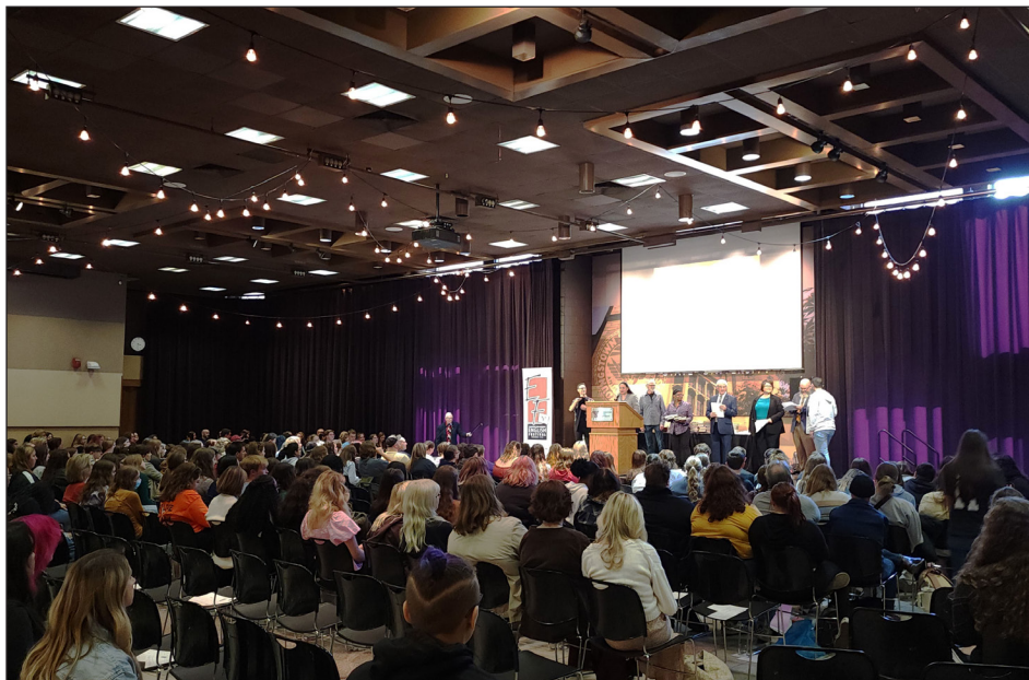
The YSU English Festival brings students from over 200 schools in Ohio and Pennsylvania.

"As students become readers, they become discerning readers, too. They can learn to select books for themselves and choose what they want to read. A part of our job is to teach students to make those decisions and those choices on their own," Buchanan said.