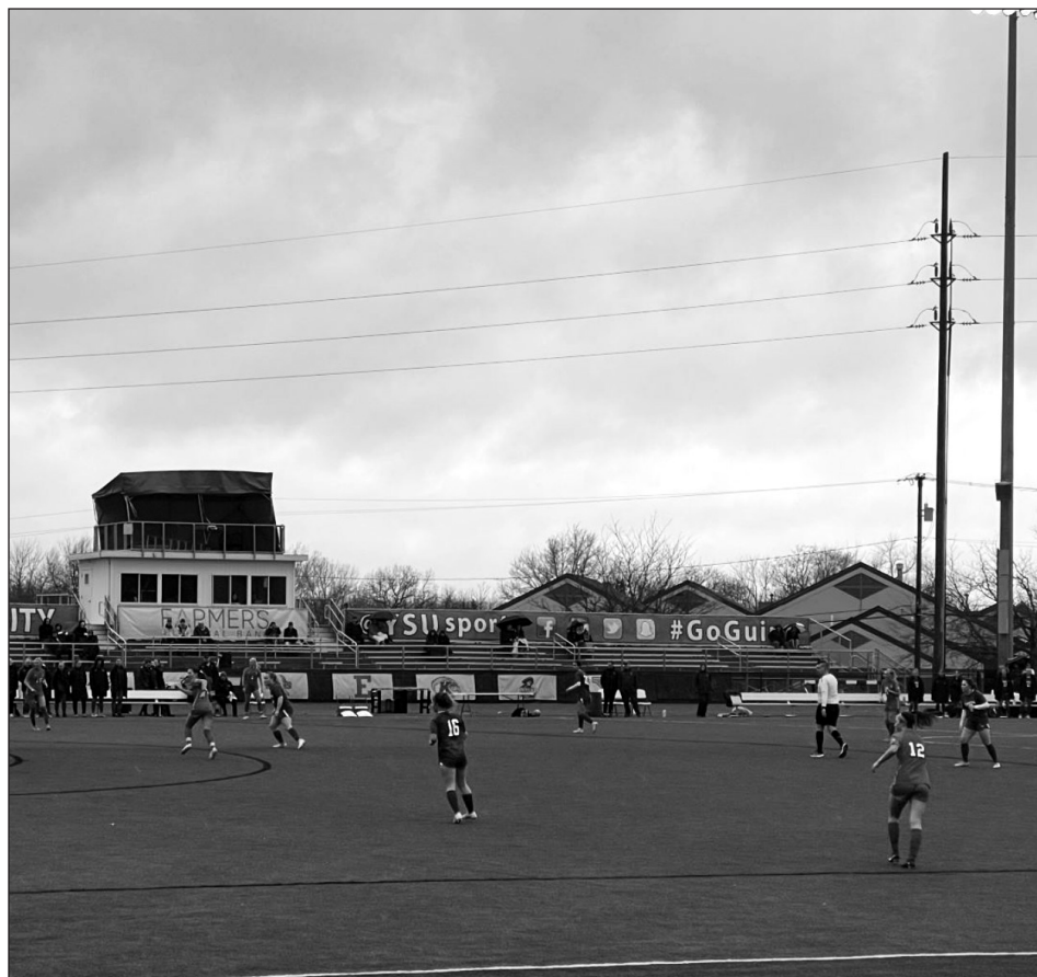
The YSU soccer team playing against Tiffin University.

Spring ball will continue as the women face off against Kent State University at 1 p.m. April 22, at Kent.