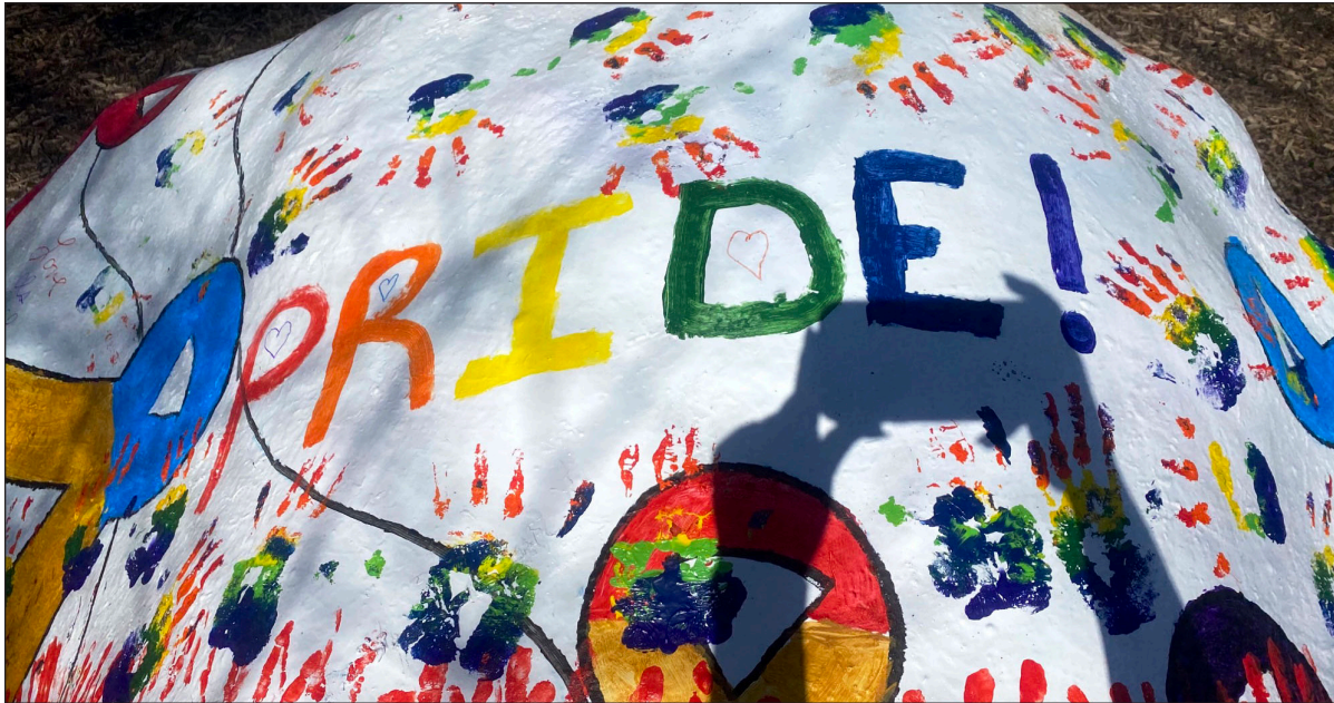
The tradition rock was painted to show pride on campus.