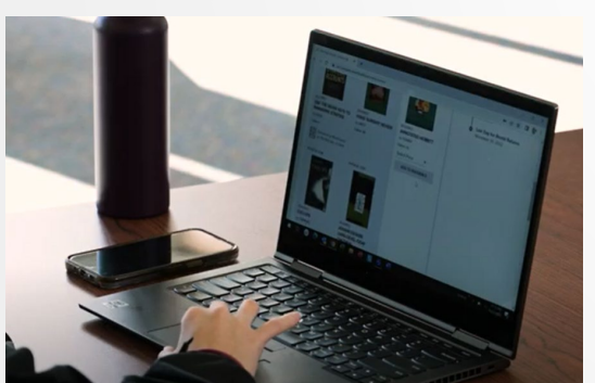
Show confirmation email with bar code