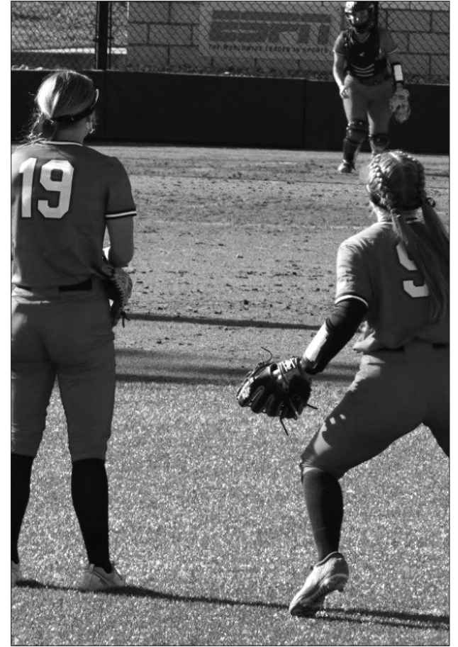
YSU softball team warms up before a game Sept. 15.