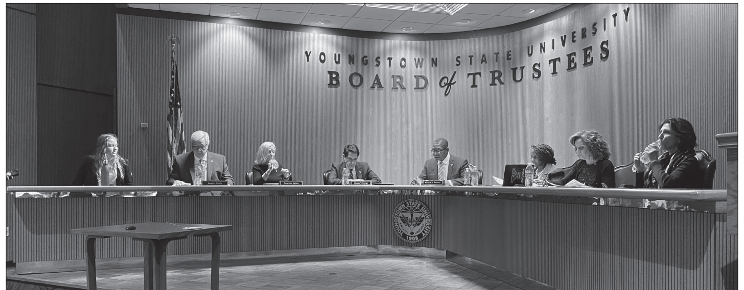
The board of trustees finalizing its decision.

The next board of trustees meetings will be Dec. 6 and 7 on the first floor of Tod Hall.