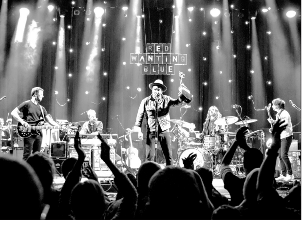
Red Wanting Blue (above) live in concert.

VIP packages are also available. They include early entry, a sit-in on the band's sound check and a signed concert poster, which can also be purchased at redwantingblue.com.