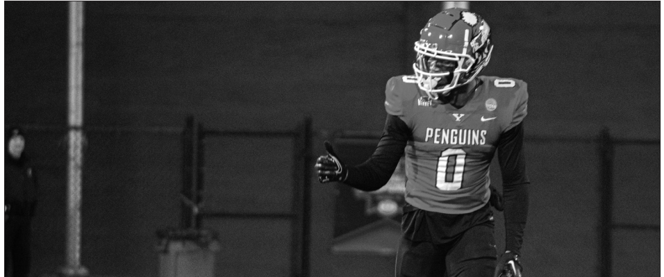
The Penguins finished the 2023 season 8-5 overall, with several players entering the NCAA Transfer Portal.