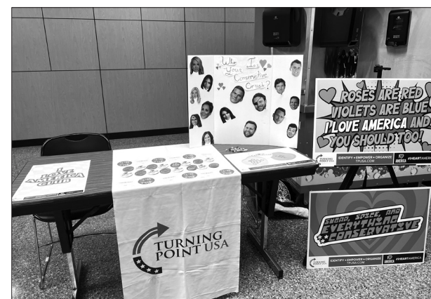
A Turning Point USA table in Kilcawley Center.

Students interested in joining Turning Point USA can contact Lutz at mslutz@student.ysu.edu .