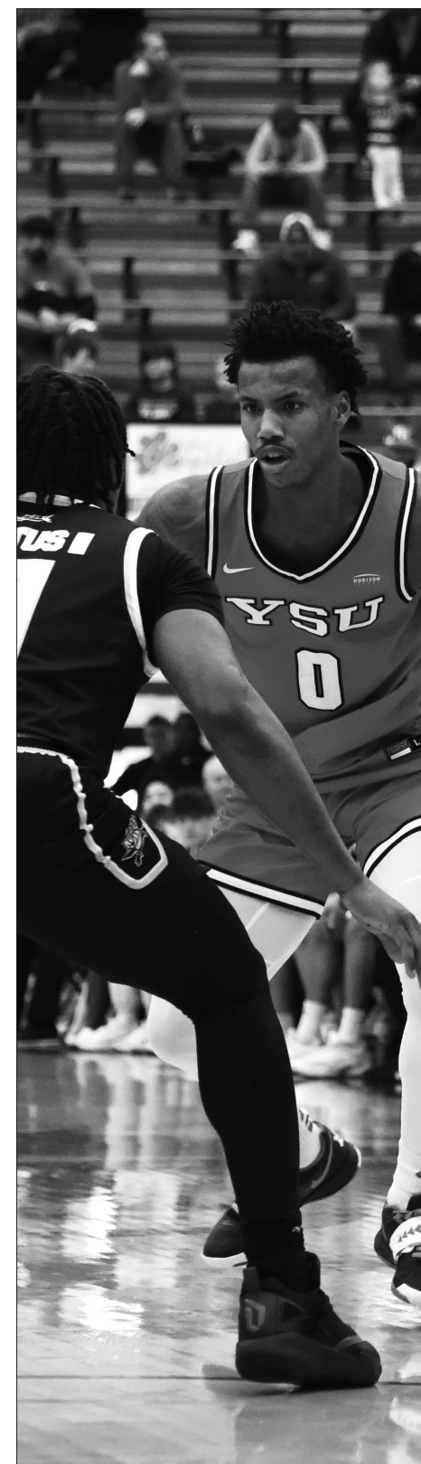
Brandon Rush dribbles around a Northern Kentucky opponent.