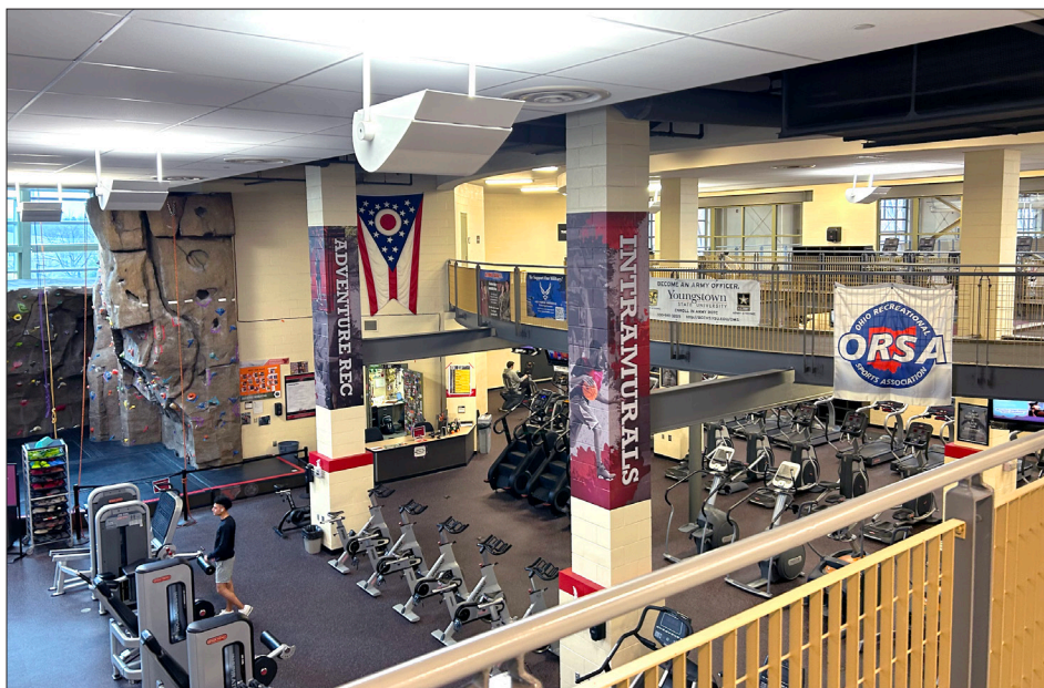
Members of the Rec can use treadmills, weights, workout machines, a rockwall and more.