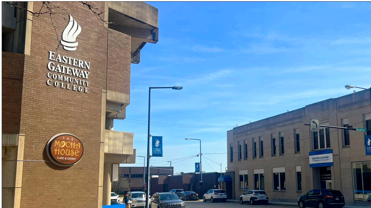
Eastern Gateway's downtown Youngstown location.