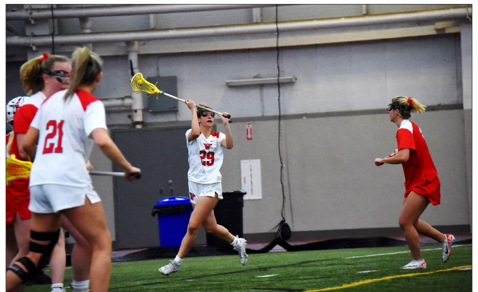
Female athletes reflect on what it means to be a woman in sports.