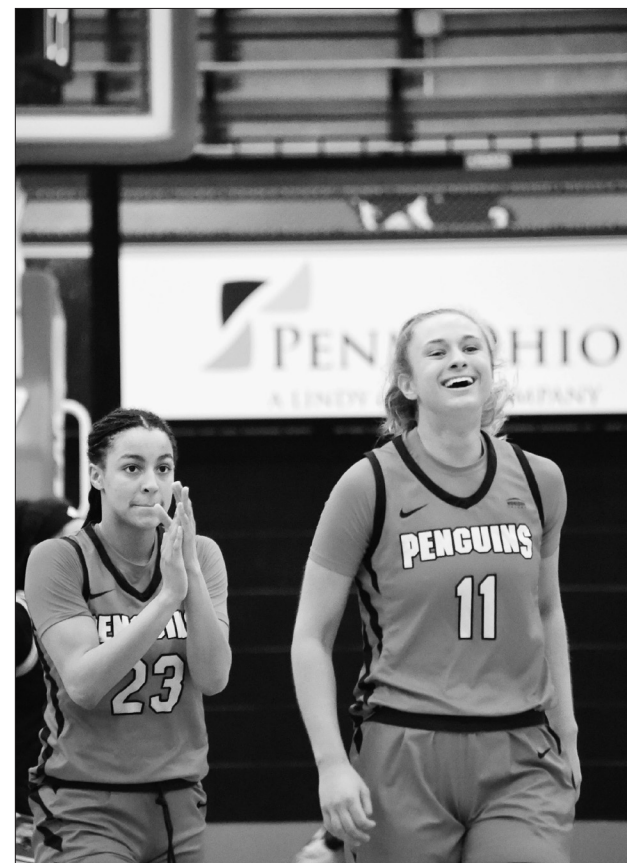
Women's basketball's first round matchup against IUPUI.