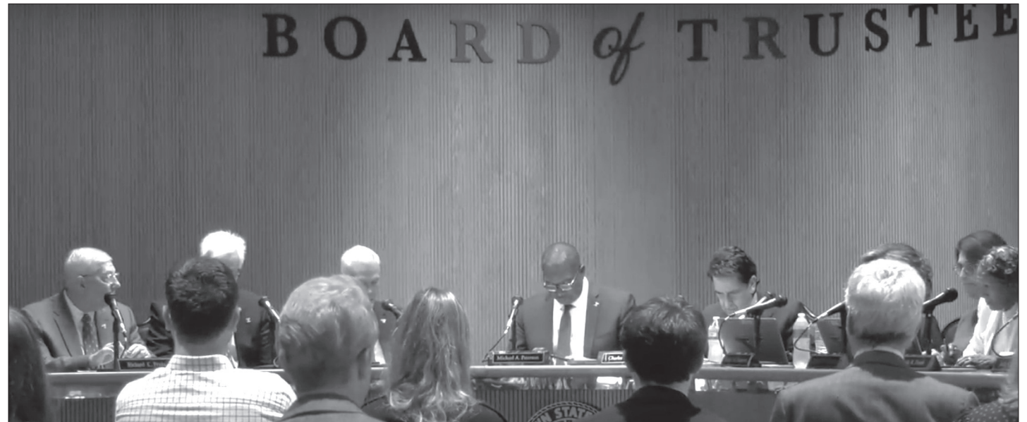
The board of trustees met March 7 and passed a resolution to aid Eastern Gateway students.