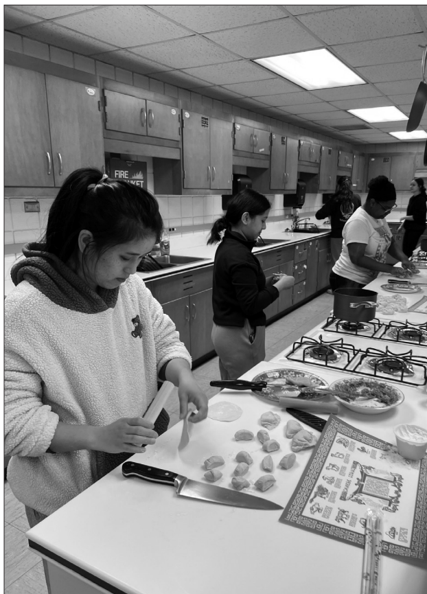
Students cooking meals in Cushwa Hall's food preparation lab.

Those interested in joining Students in Dietetics can contact the club's president, Ashton Abramson, at aabramson@student.yasu.edu .