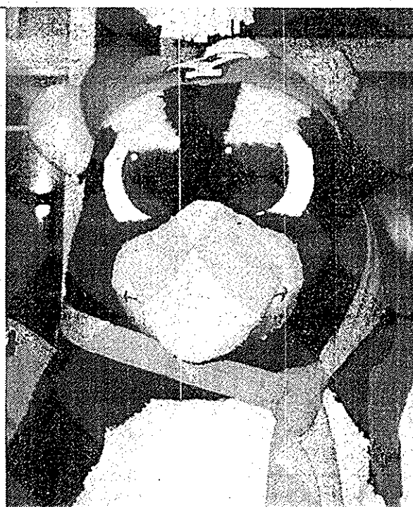
Pete the Penguin 5-11, 245 Should be wearing red YSU hat and scarf.

Last seen being shoved into a White Ford Aerostar van after Winter Commencement on Saturday, March 25. If you have seen Pete or have information about his disappearance, call 1-800-555-PETE.