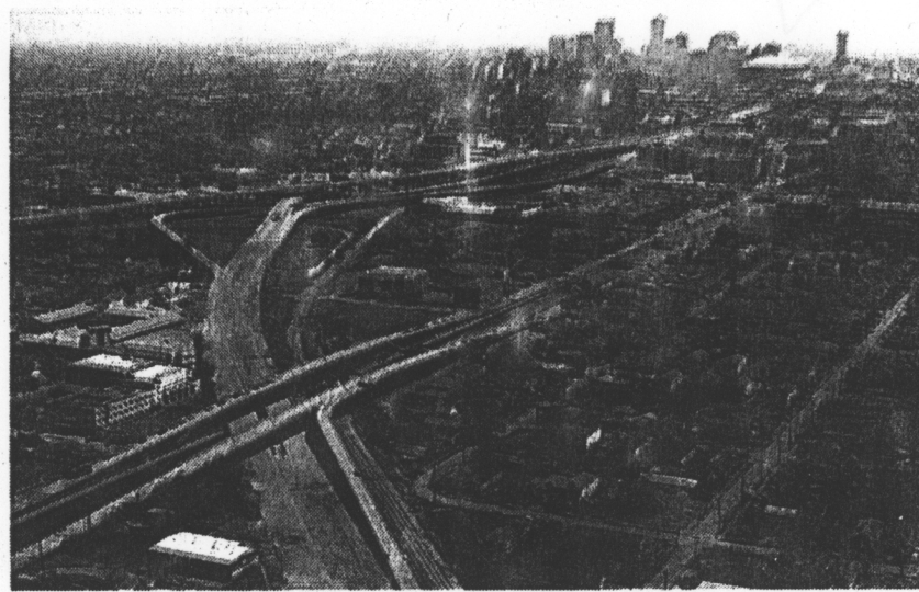
ABOVE TOP: This is a view looking from the west toward downtown New Orleans on Tuesday morning, Aug. 30, 2005.