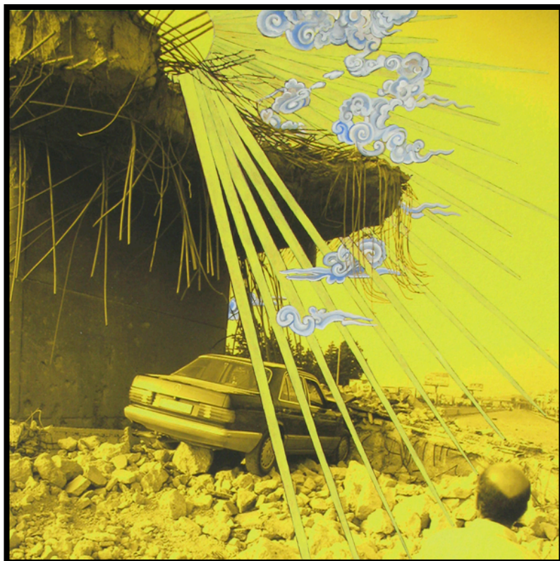
"Reveal (Yellow Crash)" is among the works on display in the McDonough exhibit that runs through Nov. 12.

For more information, call the Dana School of Music at 330-941-3636. For a complete calendar of events, visit http://web.ysu.edu/fpa .