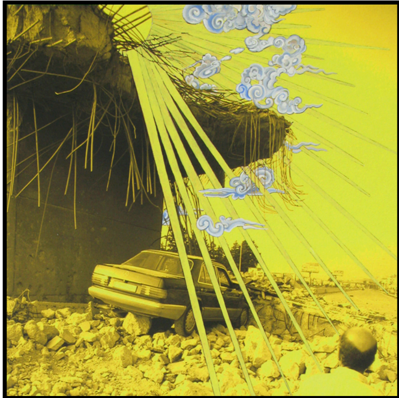
"Reveal (Yellow Crash)" is among the works on display in the McDonough exhibit that runs through Nov. 12.

The exhibition titled Cinder , focuses on images of the aftermath of war in countries like Afghanistan, Iraq, Lebanon, Pakistan and more. Slavick paints scenes of creation and cultivation over digitally manipulated photos of destruction, commenting on the remains of today after nearly a decade of war and the hope that also exists in the rubble.