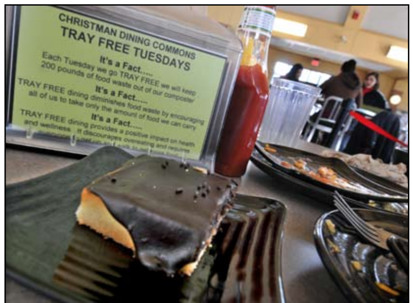
To reduce food waste and conserve water and energy, trays are nowhere to be found in Christman Dining Commons on Tuesdays. The experiment has worked, and YSU’s recycling chief hopes the program is expanded.