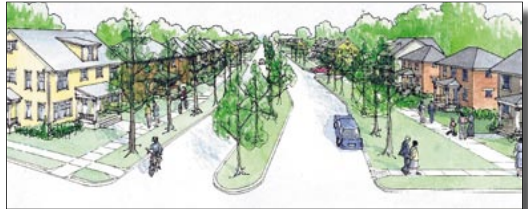
Rendering of proposed boulevard and residential units along Wirt Street, YMHA Hope VI Project — Courtesy of Perkins Eastman Architects PC