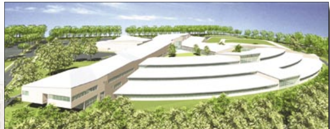
Rendering of the new East High School — Courtesy of Ricciuti Balog and Partners Architects