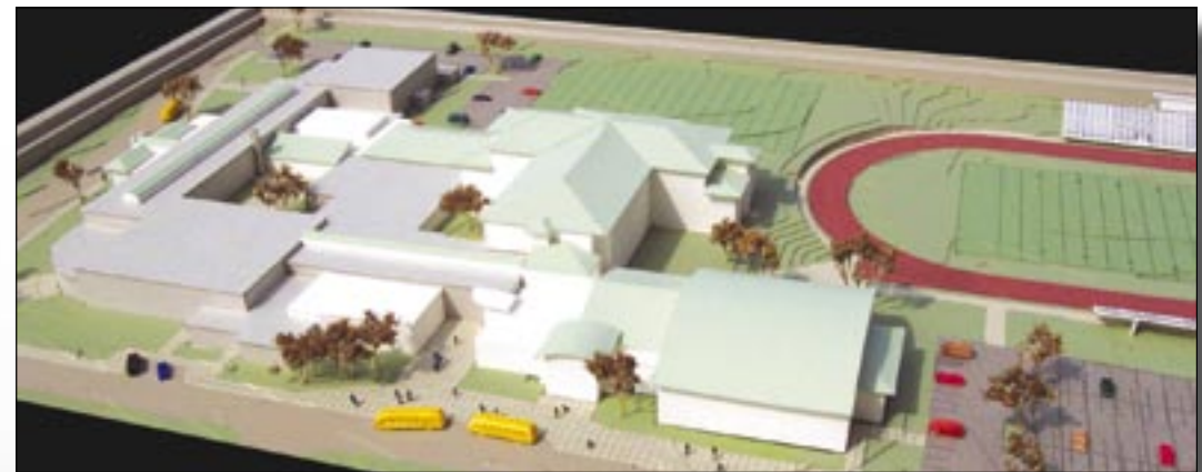
Model of Chaney High School with new addition— Courtesy of Olsavsky-Jamimet Architects