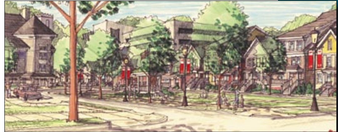
Rendering of Smoky Hollow neighborhood