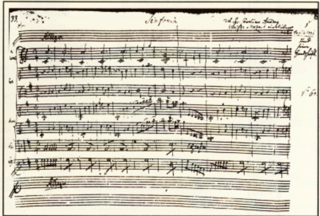
The opening to Wolfgang Amadeus Mozart's Symphony No. 10 in G major, K. 110 . We'll be playing all 41 of Mozart's symphonies in April. The schedule is on page 4.