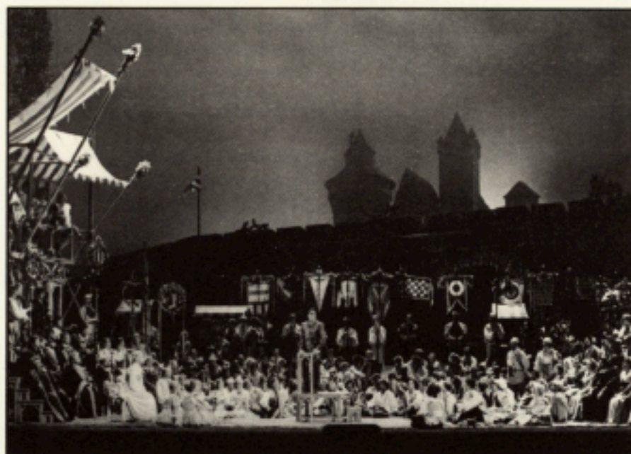
A scene from the Metropolitan Opera's production of Richard Wagner's Die Meistersinger