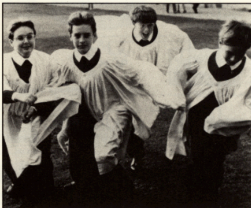
Members of the King's College Choir, who participate in A Festival of Nine Lessons and Carols that airs Thursday, December 24 at 10:00 am.

The Christmas season has inspired some of our best-loved classics, and this year WYSU will be offering some traditional favorites as part of our special holiday programming. Look for a new recording of the Bach Christmas Oratorio , performed live in concert at the 1998 Bach Festival; and a new performance of Handel's Messiah , featuring Cleveland's early music ensemble, Apollo's Fire. Annual favorites such as the Festival of Nine Lessons and Carols from King's College, Cambridge and the yearly concert offered by the internationally acclaimed Dale Warland Singers also keep their places in our schedule. There will be some newcomers as well, including specials featuring Chanticleer, one of America's leading vocal ensembles, and an hour of Christmas music from our nation's earliest days. For many, it is music that best defines the holiday season, and WYSU will have some of the finest holiday music available throughout December. Individual program listings are on page 4.