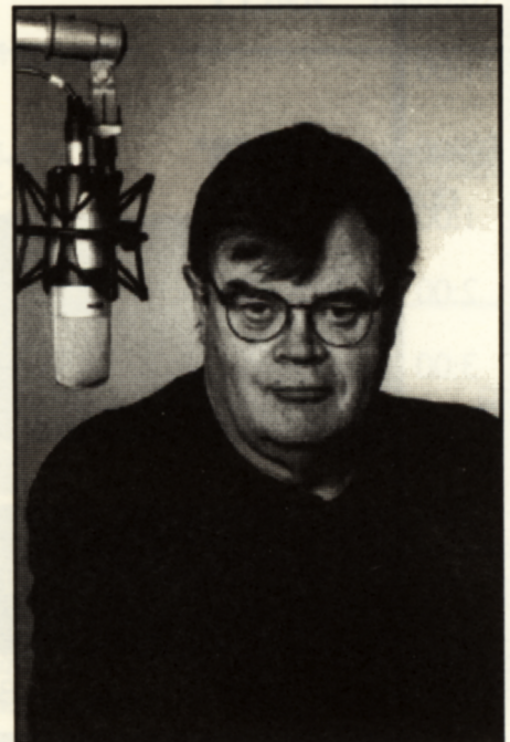
Garrison Keillor, host of A Prairie Home Companion .