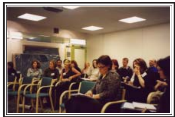
The first meeting of the Working-Class Lives: Sociologies and Geographies Seminar, at the University of Newcastle in the UK, generated lively discussions about the study of class in the U.S. and England.