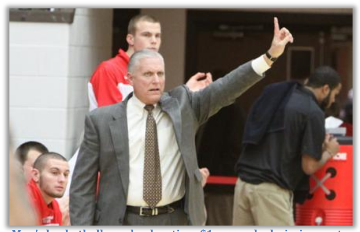
Men's basketball coach advertises $1 general admission seats for remaining home games this season.

The Youngstown State University Athletic Department, in conjunction with 570 WKBN, is offering a special $1 ticket price to attend YSU men's and women's basketball games for the remainder of the season.