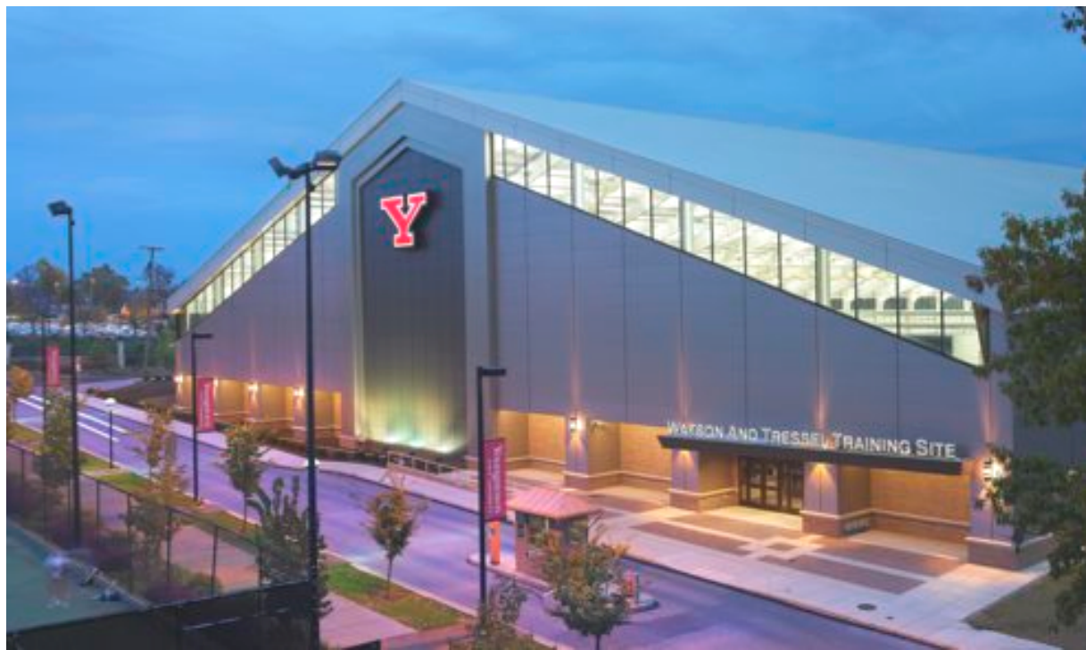
The WATTS, YSU's new state-of-the-art indoor athletics facility, will be open to the public for a 10-week open track program Jan. 3 through March 8. Read more in this issue of the YSU News Briefs . This is the final edition of the YSU News Briefs for 2011. Happy Holidays and Happy New Year!

The facility will be open for running, walking, jogging and hurdles on the track. One long-jump pit will be open for practice, and one high-jump mat with a bungee bar will be available for practice. The pole vault area will not be available. The field